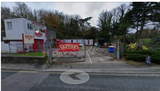
Original Google street view 2020