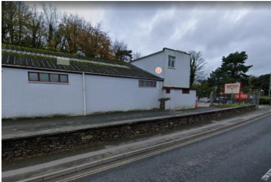
Original Google street view 2020

Skinner's Brewery sits in an industrial area in Truro. It is surrounded by business located along the South and East, whilst on the North and West side are trees. Skinner's Brewery is surrounded by a mix of materials and built architectural characters.