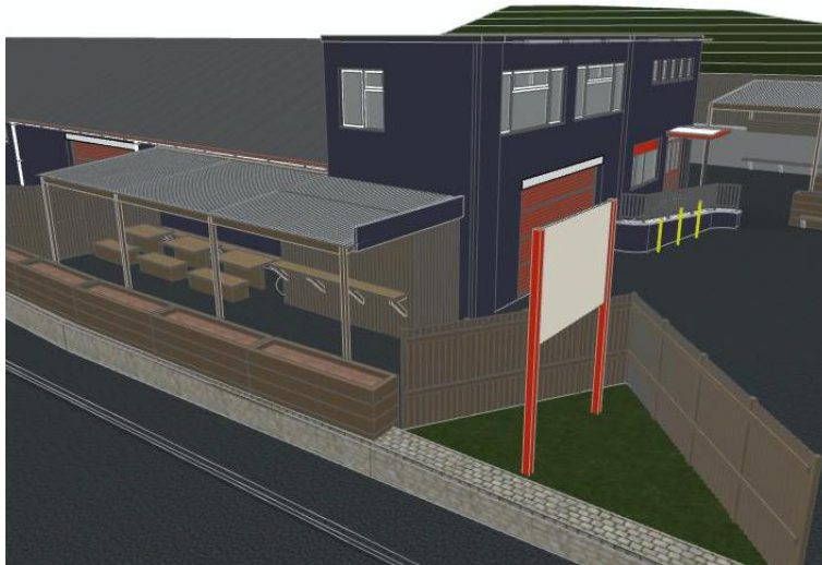
Visualisation of the front proposal