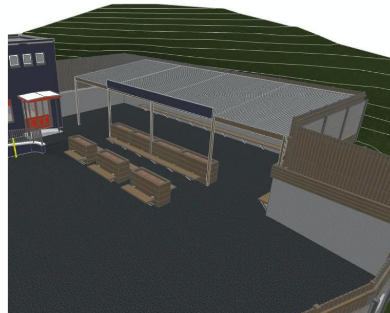
Visualisation of the rear proposal