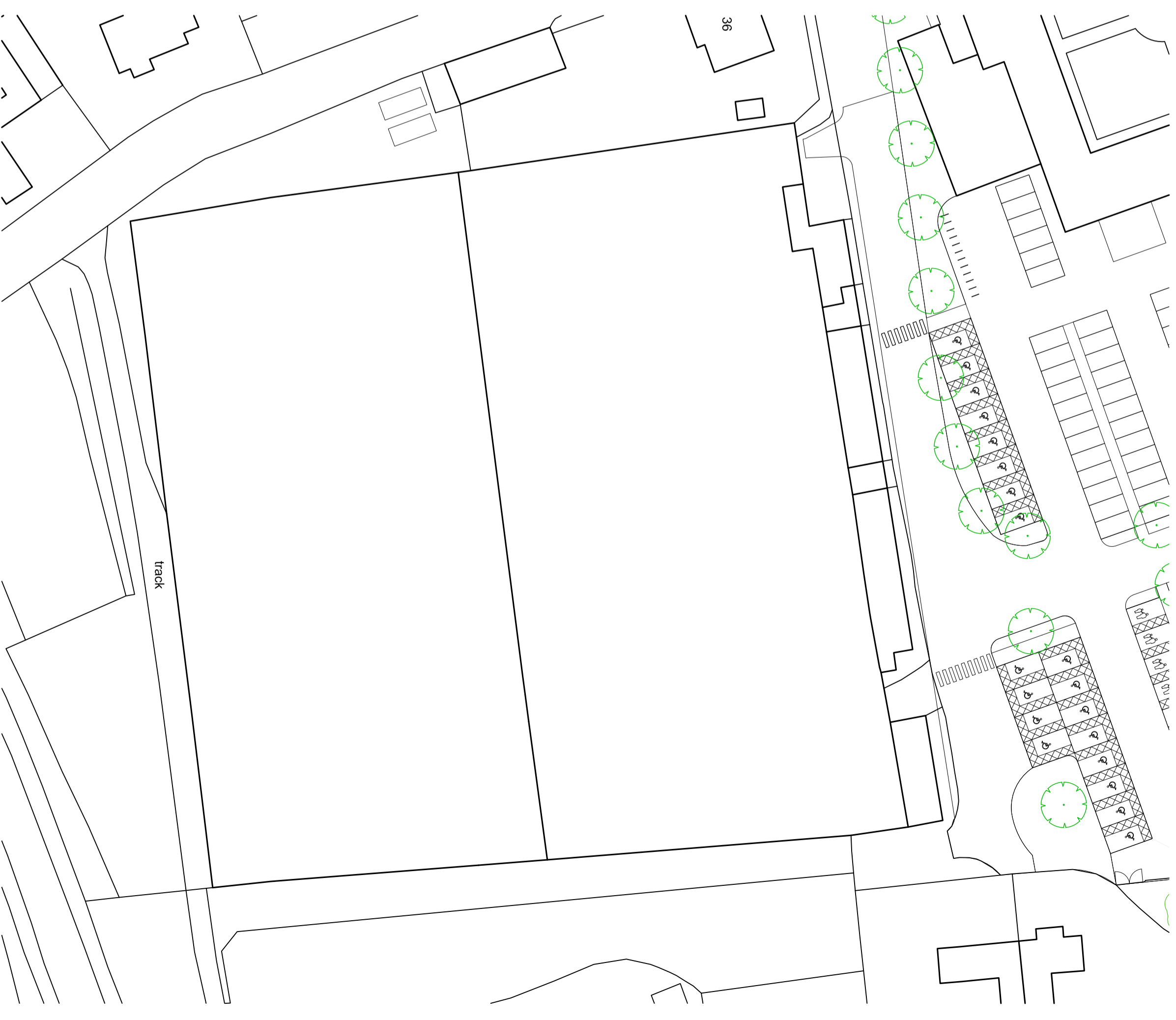
Block plan (1:500)

Thurlow Nunn Standen Ltd Specialist Installations Division