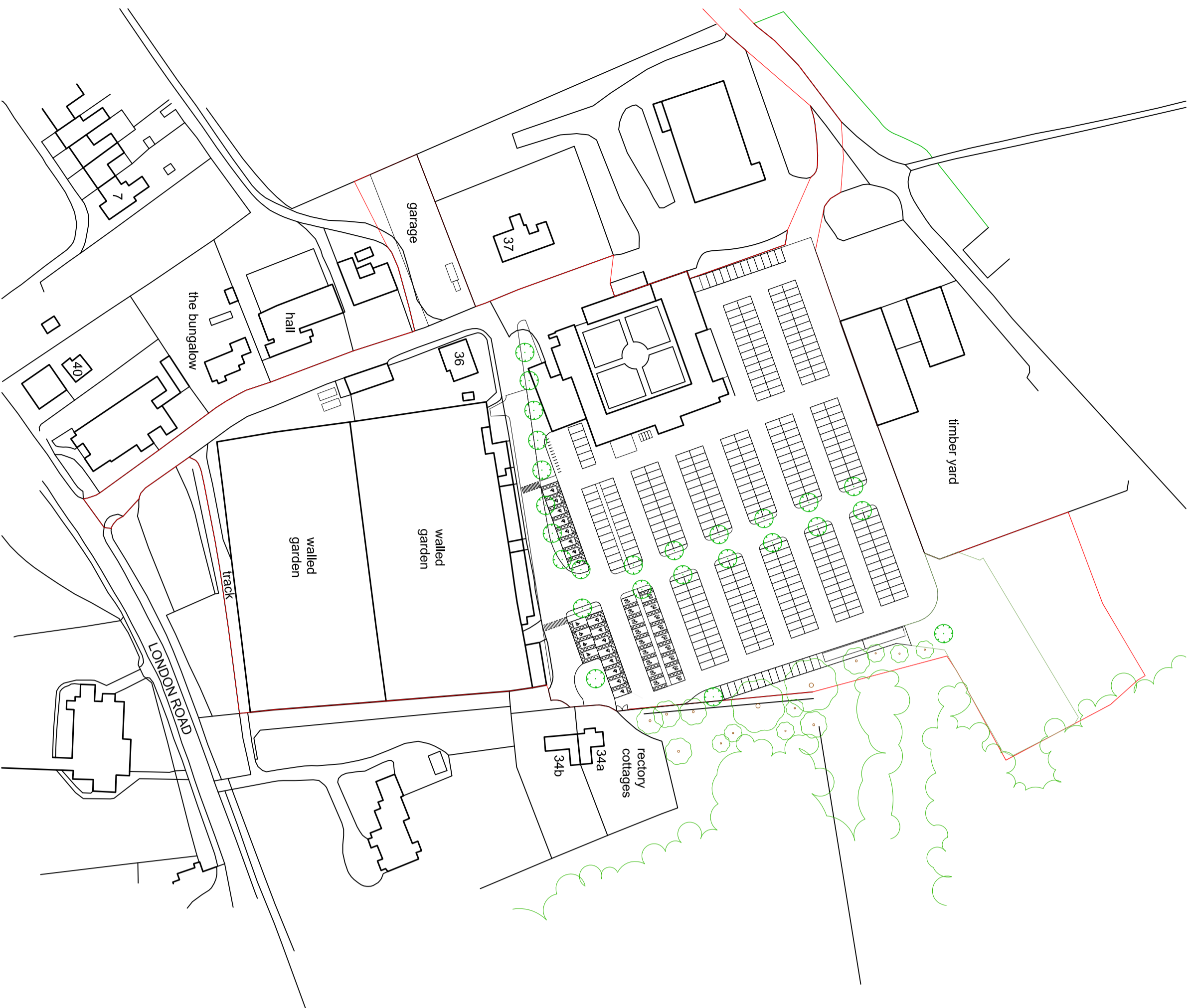
Location plan (1:1250)