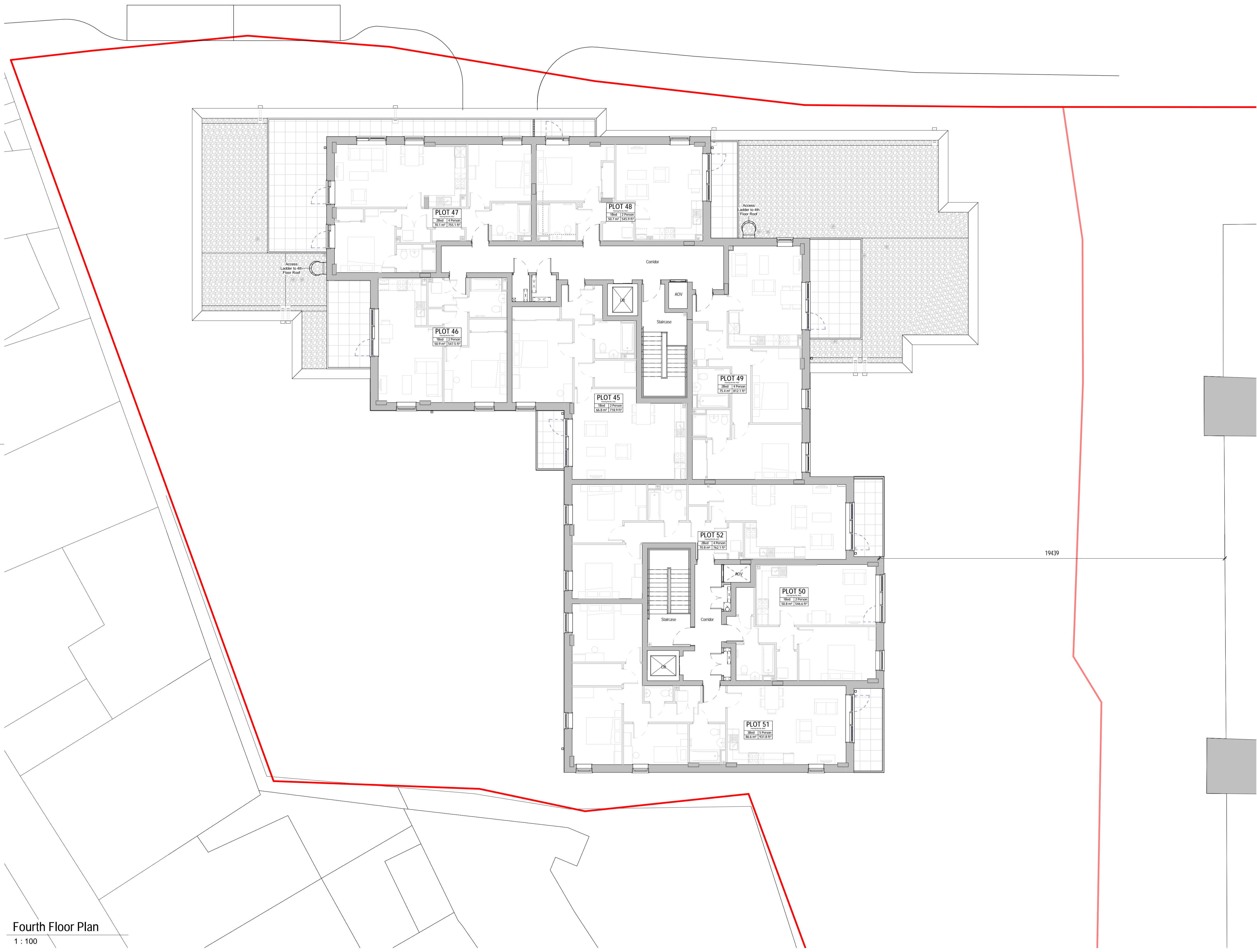
Fourth Floor Plan 1 : 100