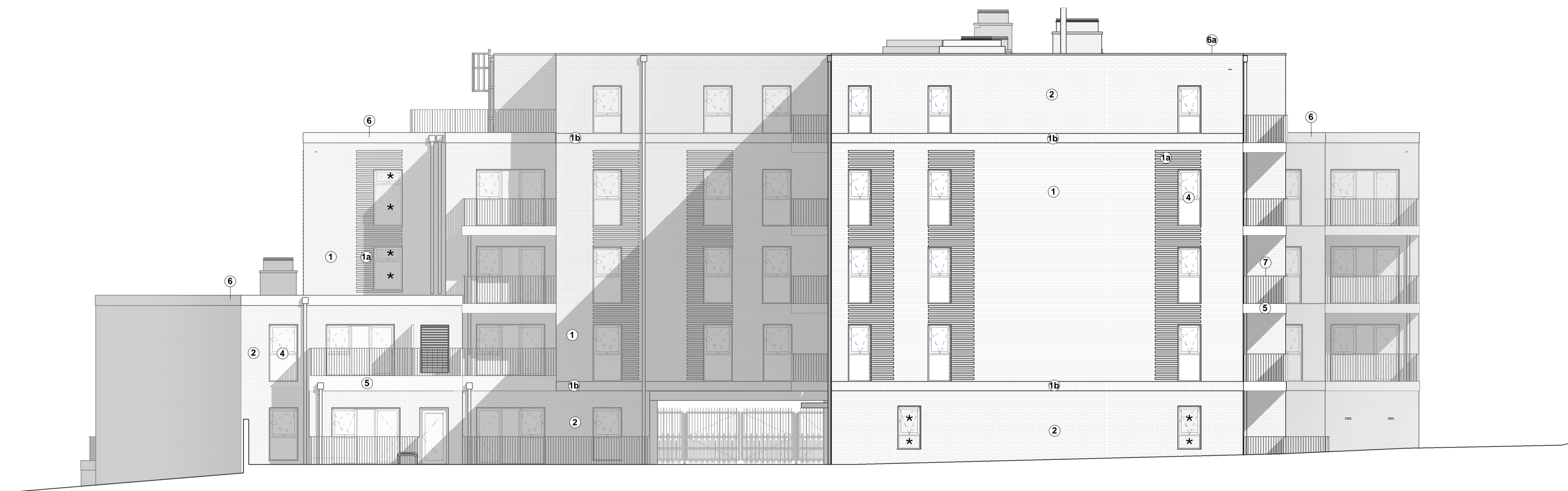
South East Elevation 1 : 100

DO NOT SCALE - ASK FOR DIMENSION USE ONLY FOR PURPOSE INDICATED BELOW