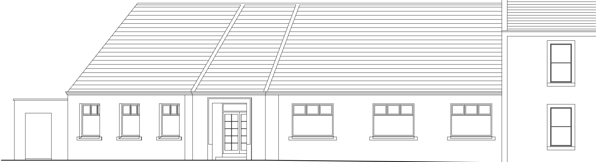
existing elevation to sandstell road scale 1:100