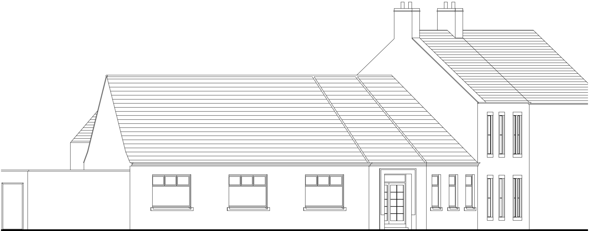
existing elevation to dock road scale 1:100