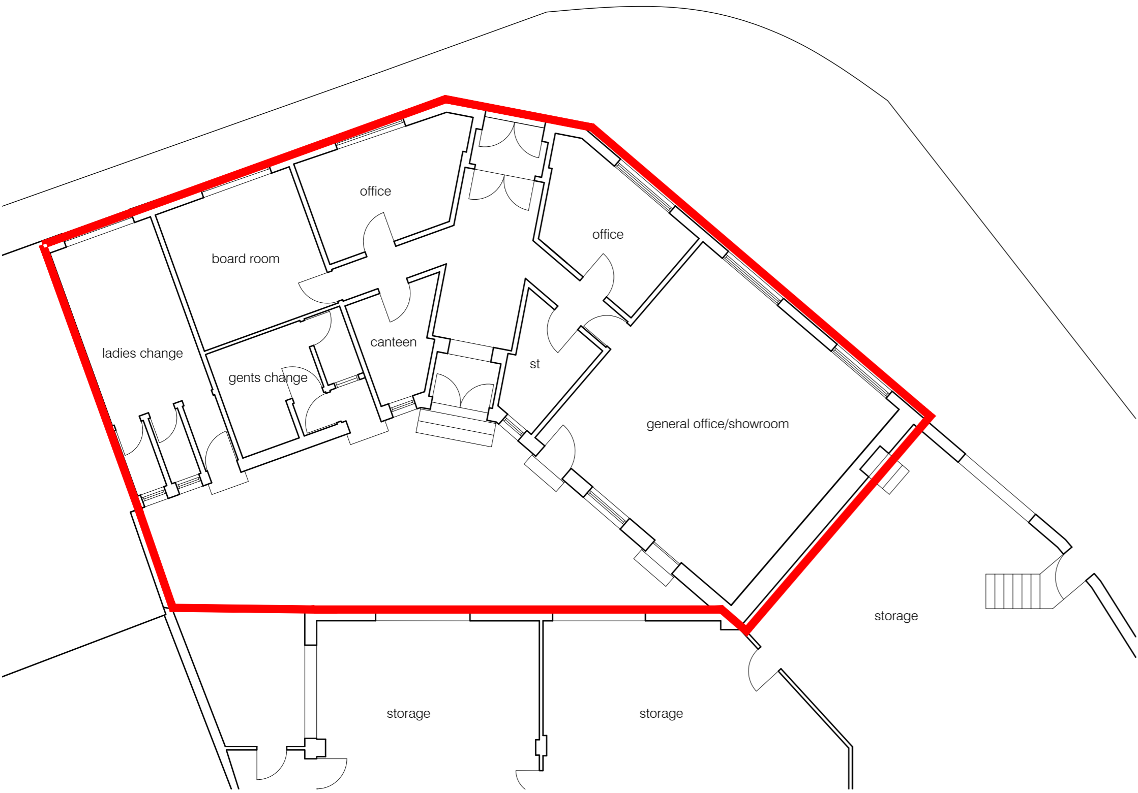
existing floor plan scale 1:100