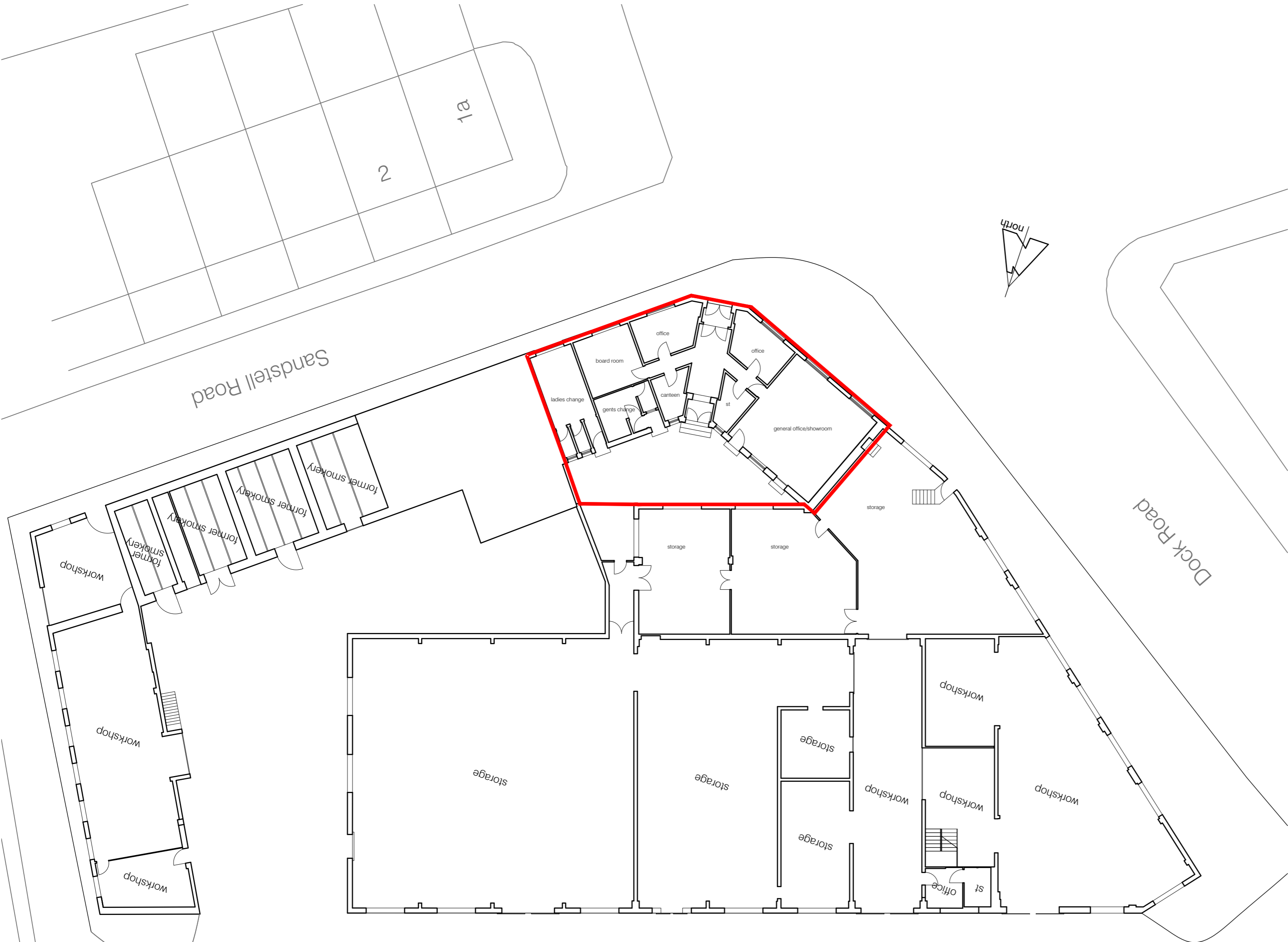
existing block plan scale 1:200