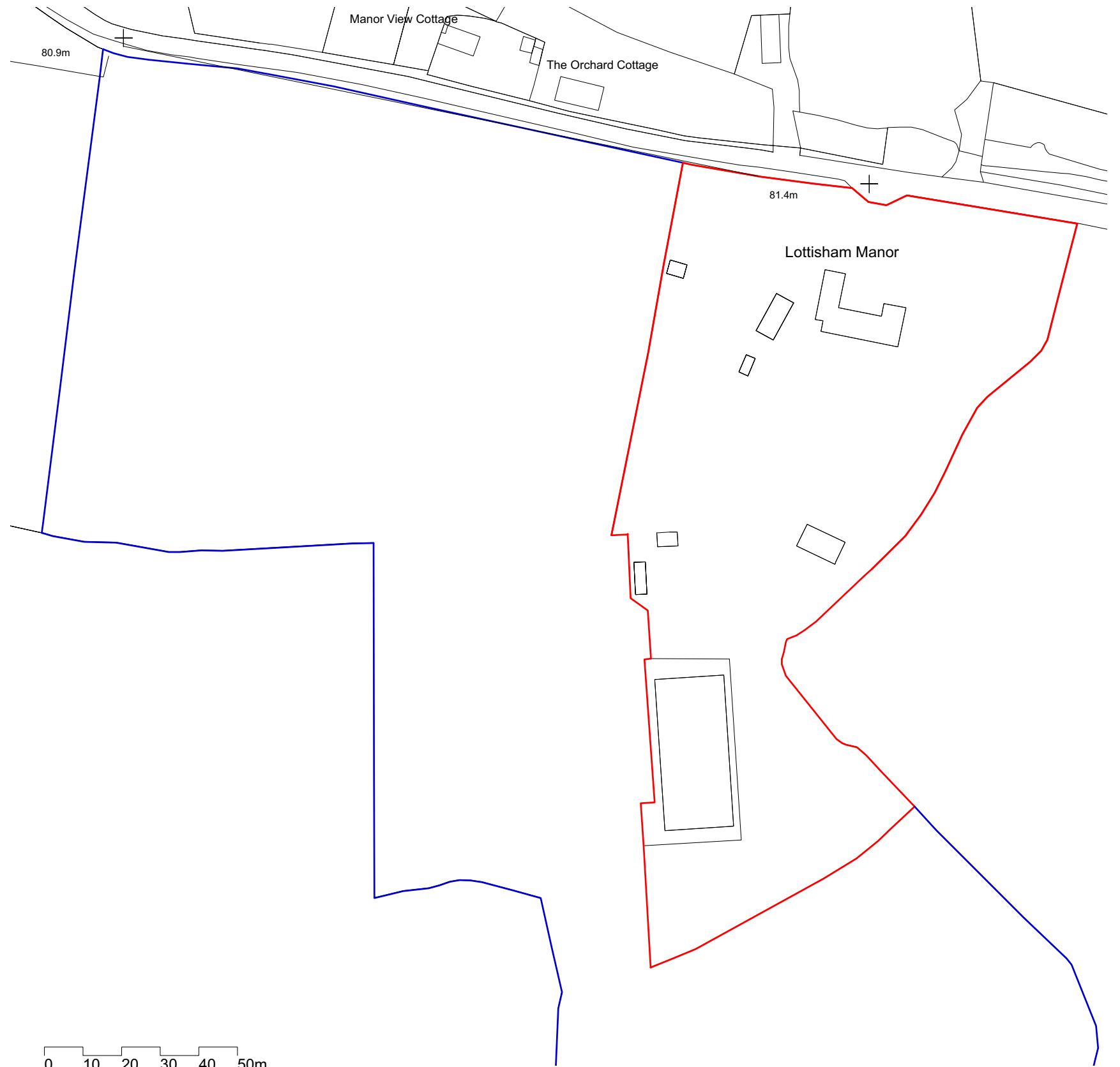
0 10 20 30 40 50m 1:1250