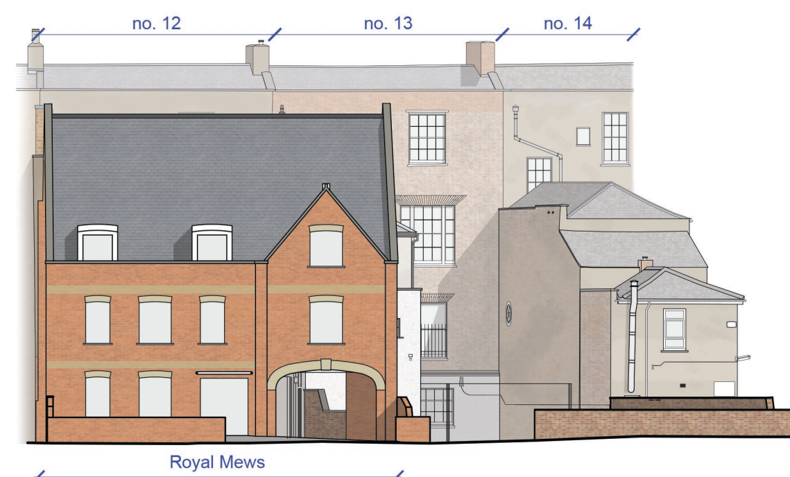
01 EXISTING CONTEXT ELEVATION FROM ST GEORGE'S PLACE 1:200