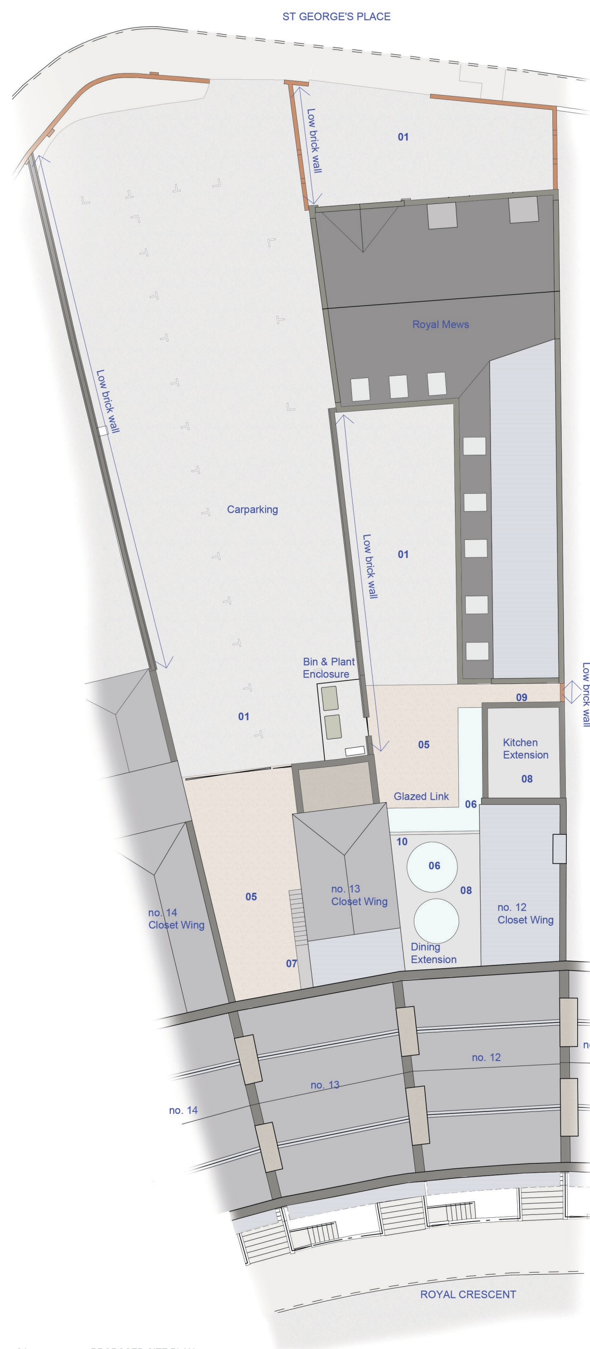
04 PROPOSED SITE PLAN 1:200