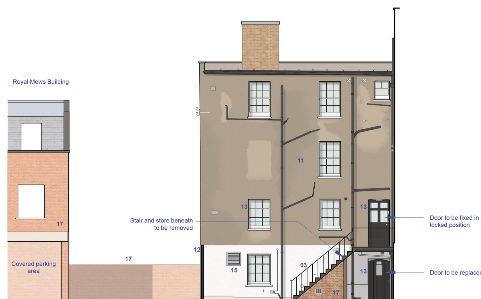
02 NO.12 CLOSET WING EXISTING ELEVATION A 1:100