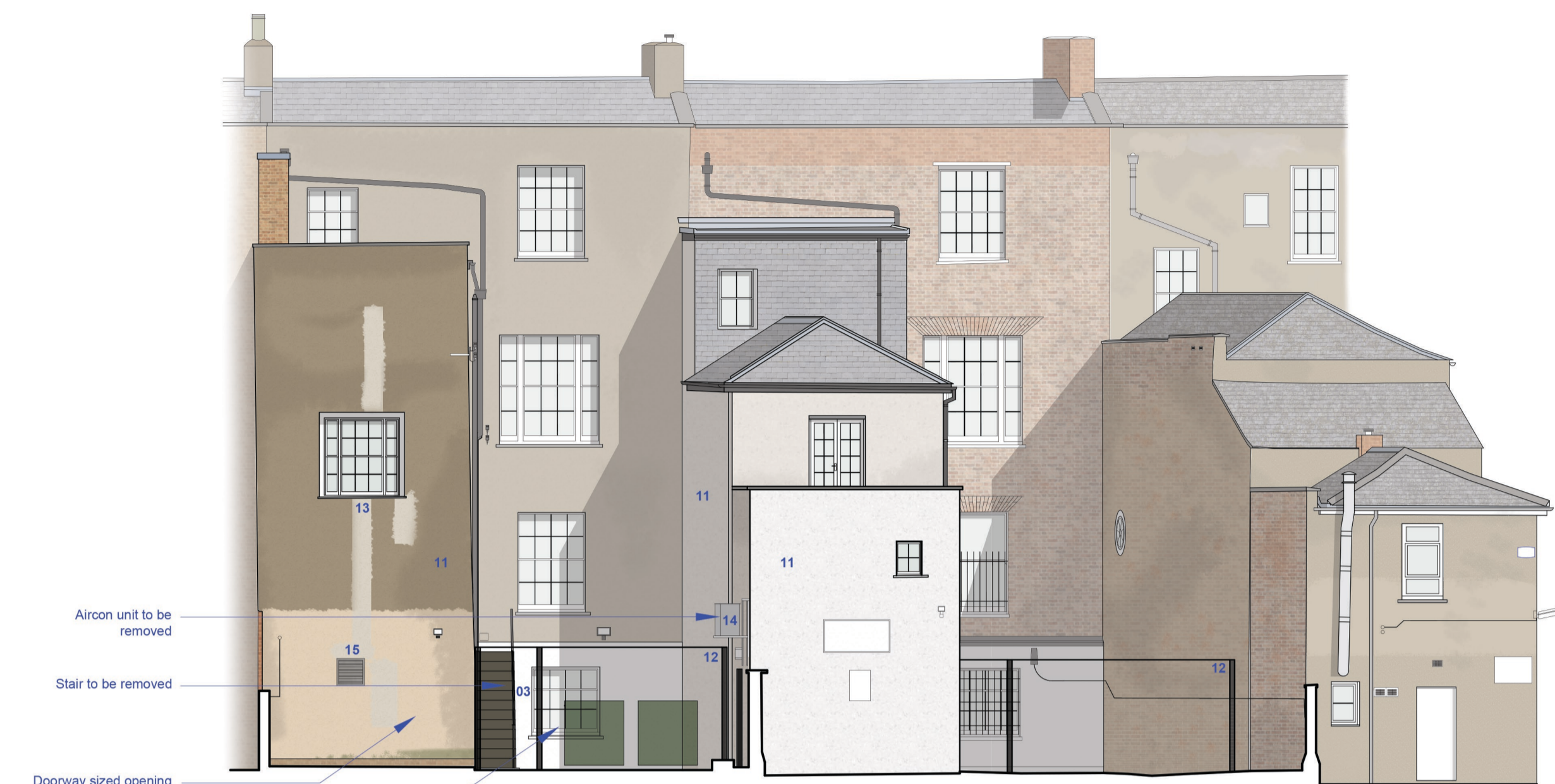
01 EXISTING REAR CONTEXT ELEVATION 1:100