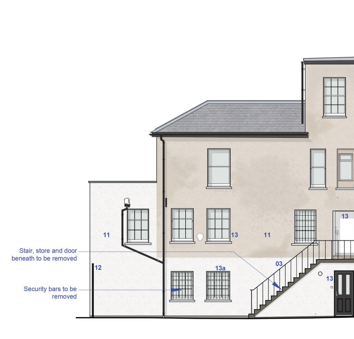
04 NO.13 CLOSET WING EXISTING ELEVATION B 1:100

DRAWING REPRODUCED FROM ORIGINAL SURVEY DRAWINGS BY: EDWARD GARDNER SURVEYS TEL.07775 488916