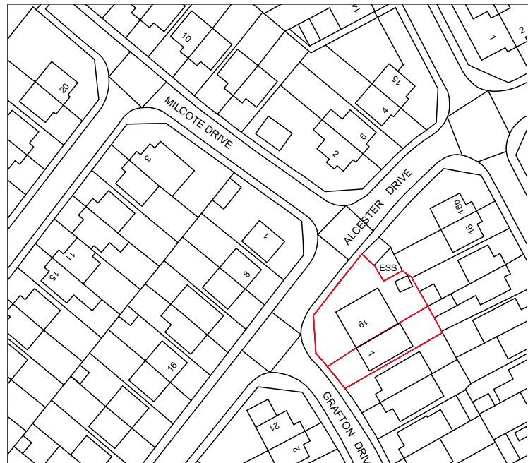
PROPOSED SITE LOCATION PLAN 1:1250