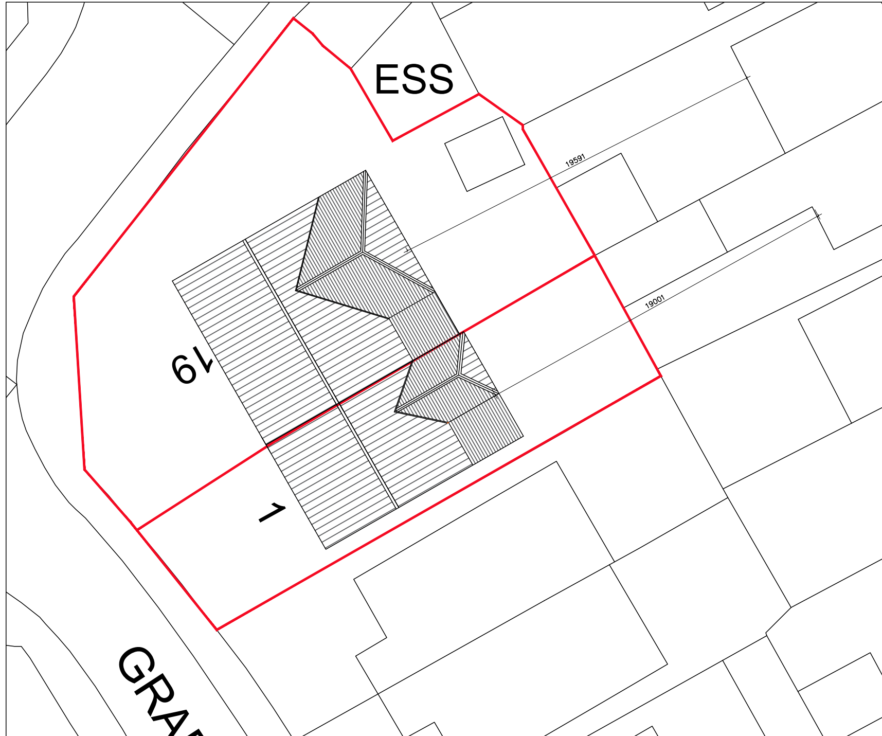
BLOCK PLAN 1:200