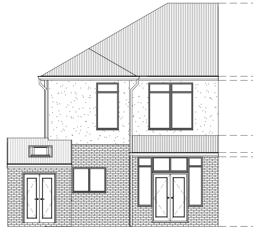
2 Rear Elevation 1 : 100