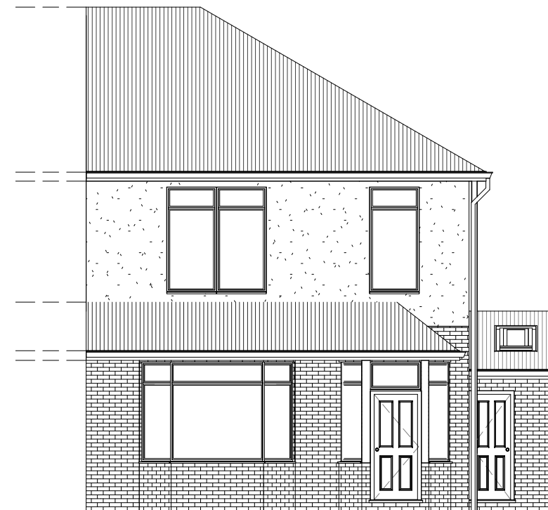
4 Front Elevation 1 : 100