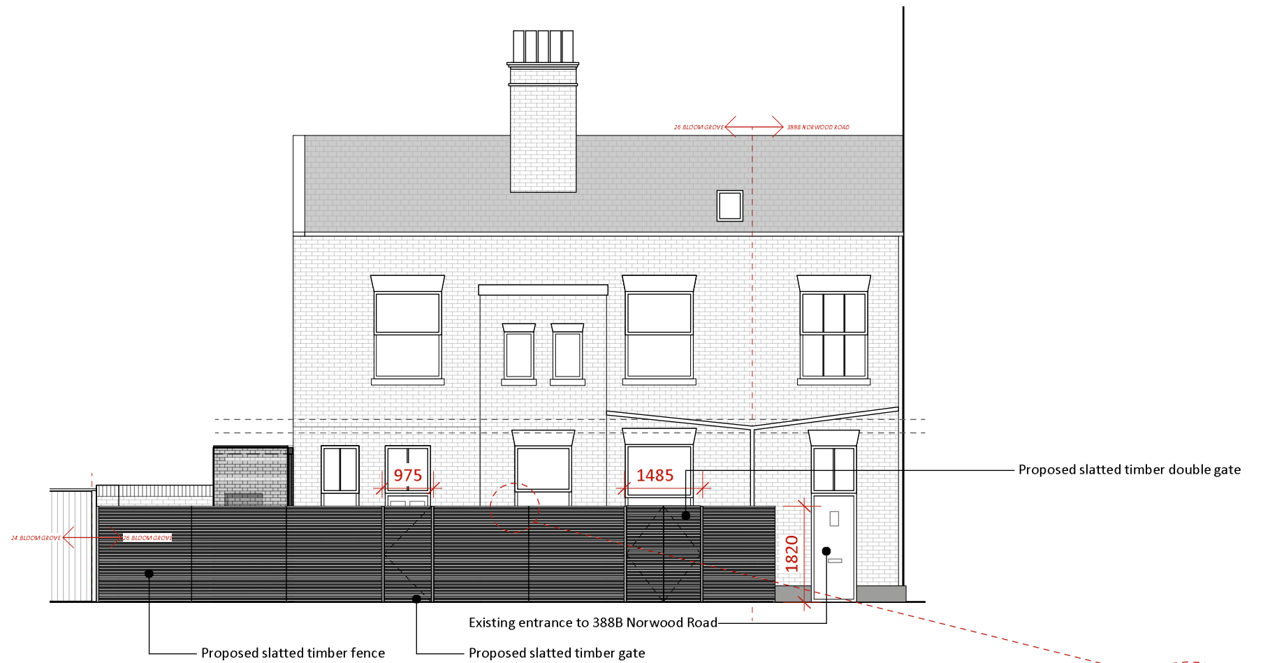
Proposed South Elevation (street) Scale: 1:100