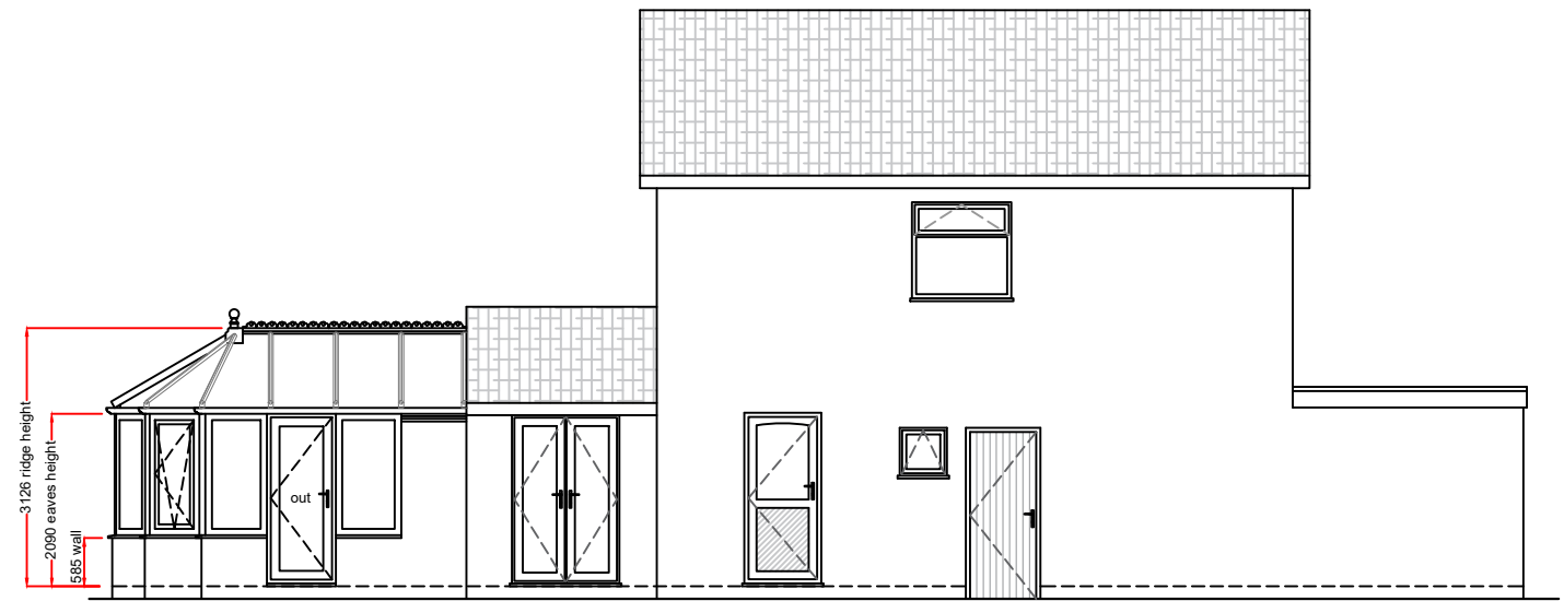
RIGHT-HAND SIDE ELEVATION