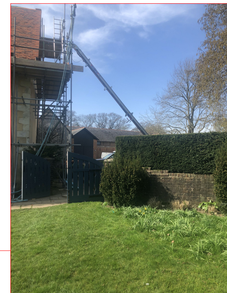
IMAGE SHOWING PROPOSED BOILER LOCATION. SLAB TO BE LOCATED AGAINST BRICK WALL WHICH IS NOT PART OF THE LISTED FABRIC AND IS OF LITTLE SIGNIFICANCE. PROPOSED LOCATION WILL ALSO PREVENT THE BOILER BEING SEEN FROM THE PRIMARY ELEVATION OF THE MAIN HOUSE

All dimensions to be checked on site. All drawings to be read in conjunction with engineer's drawings. Any discrepancies between consultants drawings to be reported to the Architect before any work commences. The Contractor's attention is drawn to the Health & Safety matters identified in the Health & Safety plan and on drawings as being potentially hazardous. These items should not be considered as a full and final list. The Work Package Contractor's normal Health & Safety obligations still apply when undertaking constructional operations both on and off site.