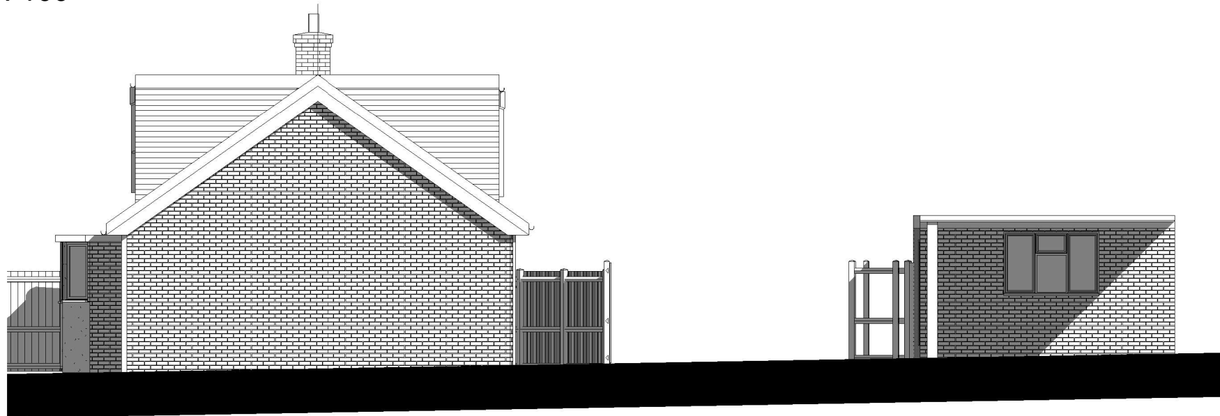
Proposed Side 2 Elevation 1 : 100