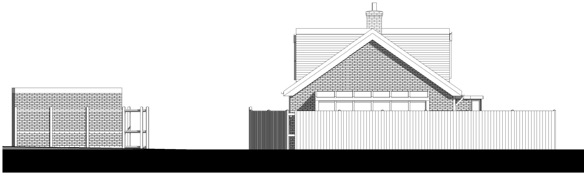
Proposed Side 1 Elevation 1 : 100