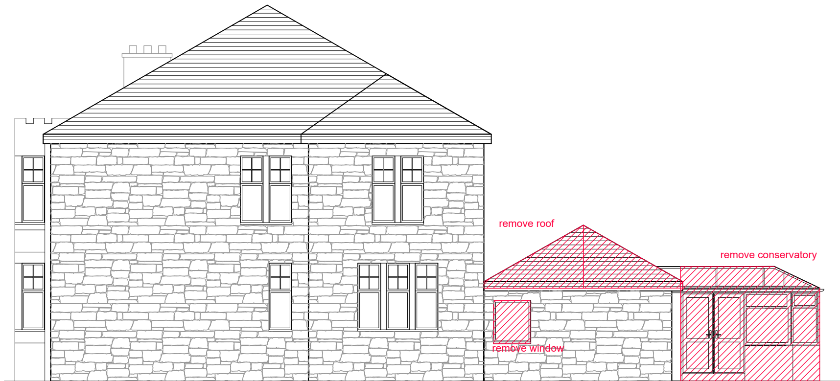
North East Elevation - as existing