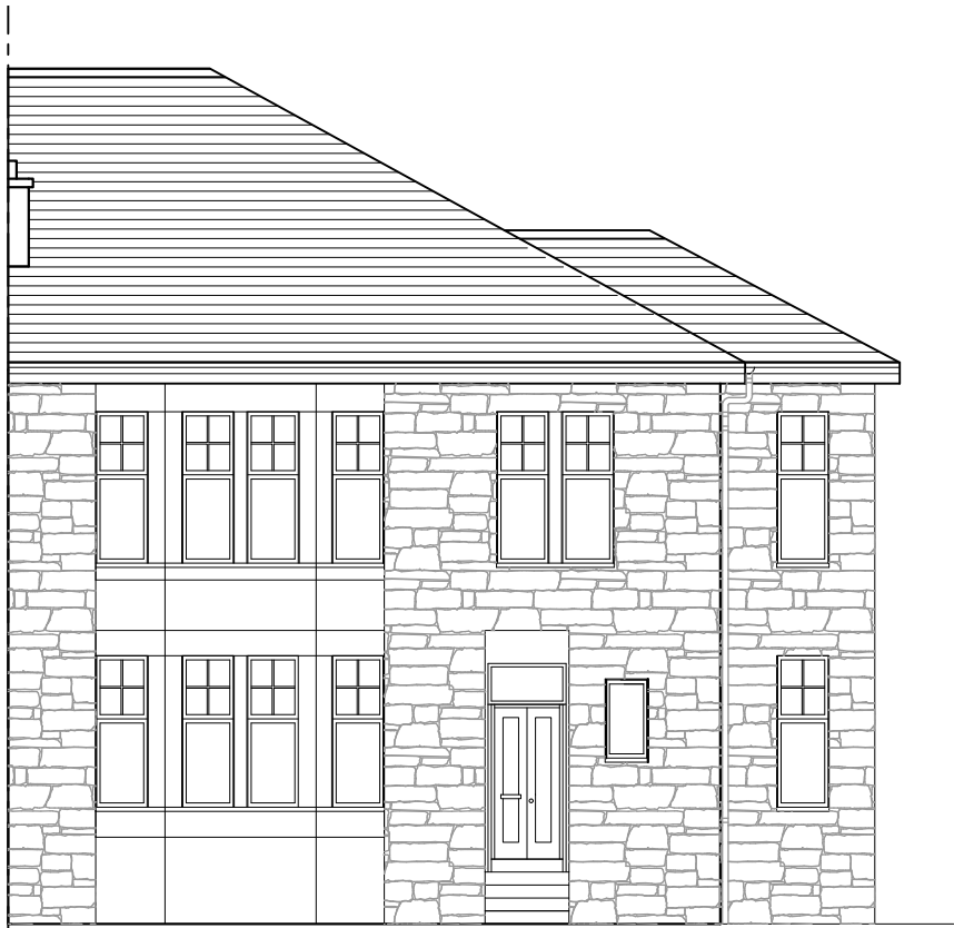
South East Elevation - as existing

Notes Do not scale from this drawing. All dimensions to be checked on site prior to construction and any discrepancies reported to the Architect. Copyright reserved.