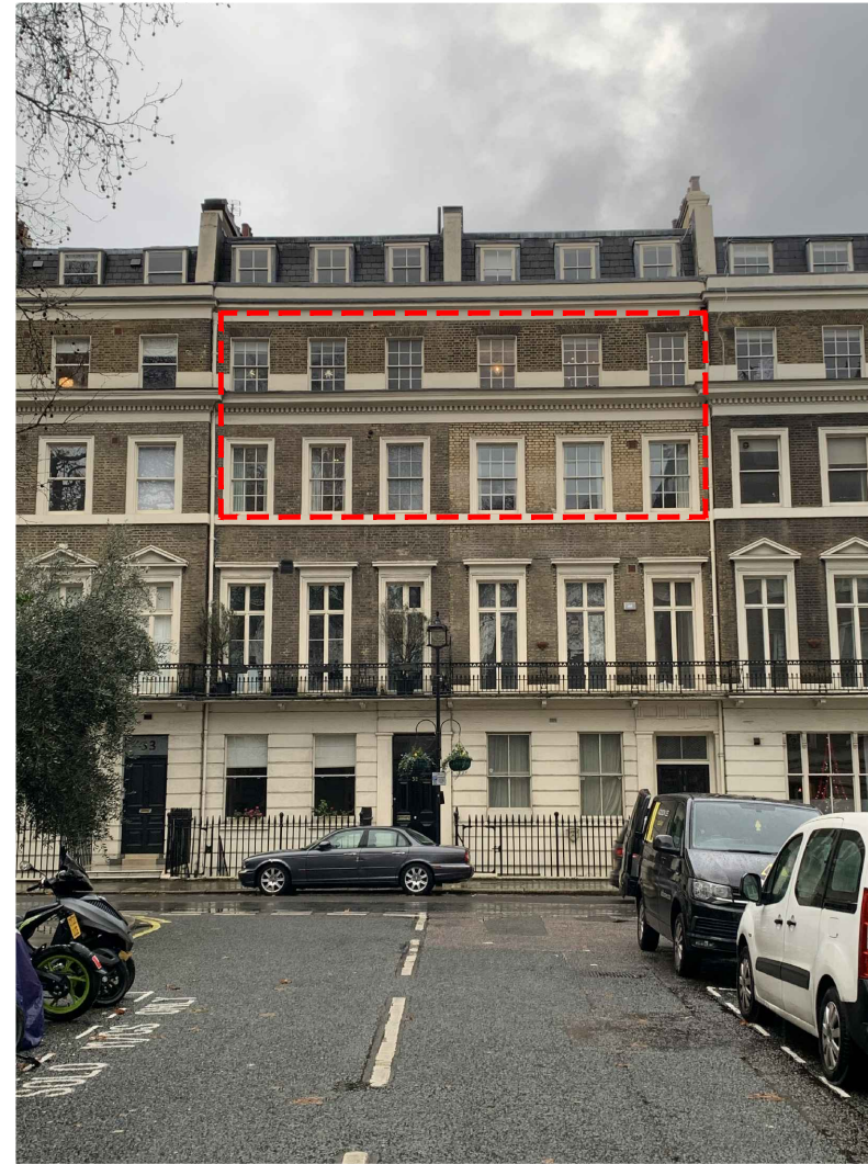
3 | EXISTING FRONT PHOTOGRAPH