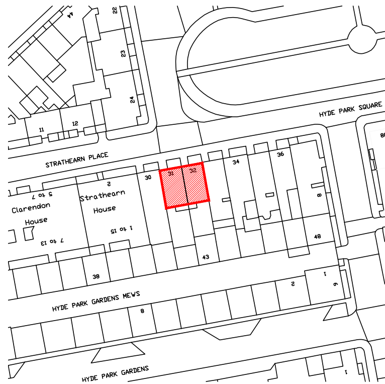
2 | LOCATION PLAN SCALE: 1:1250 @ A3