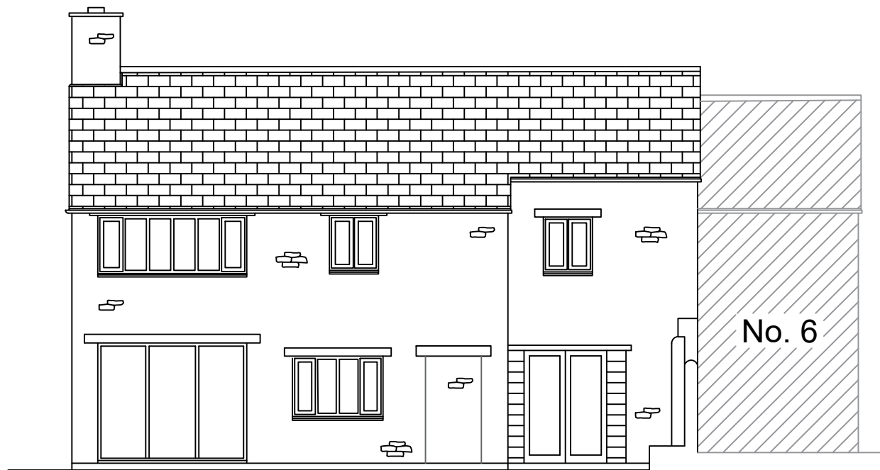
Existing front elevation