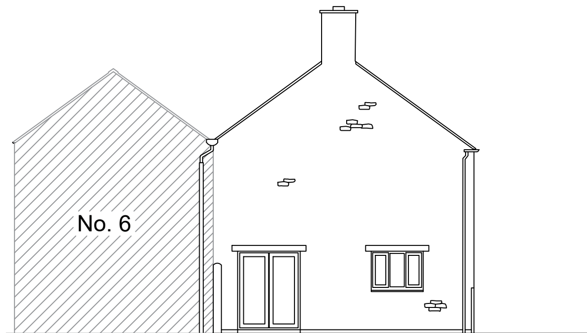
Existing south west elevation