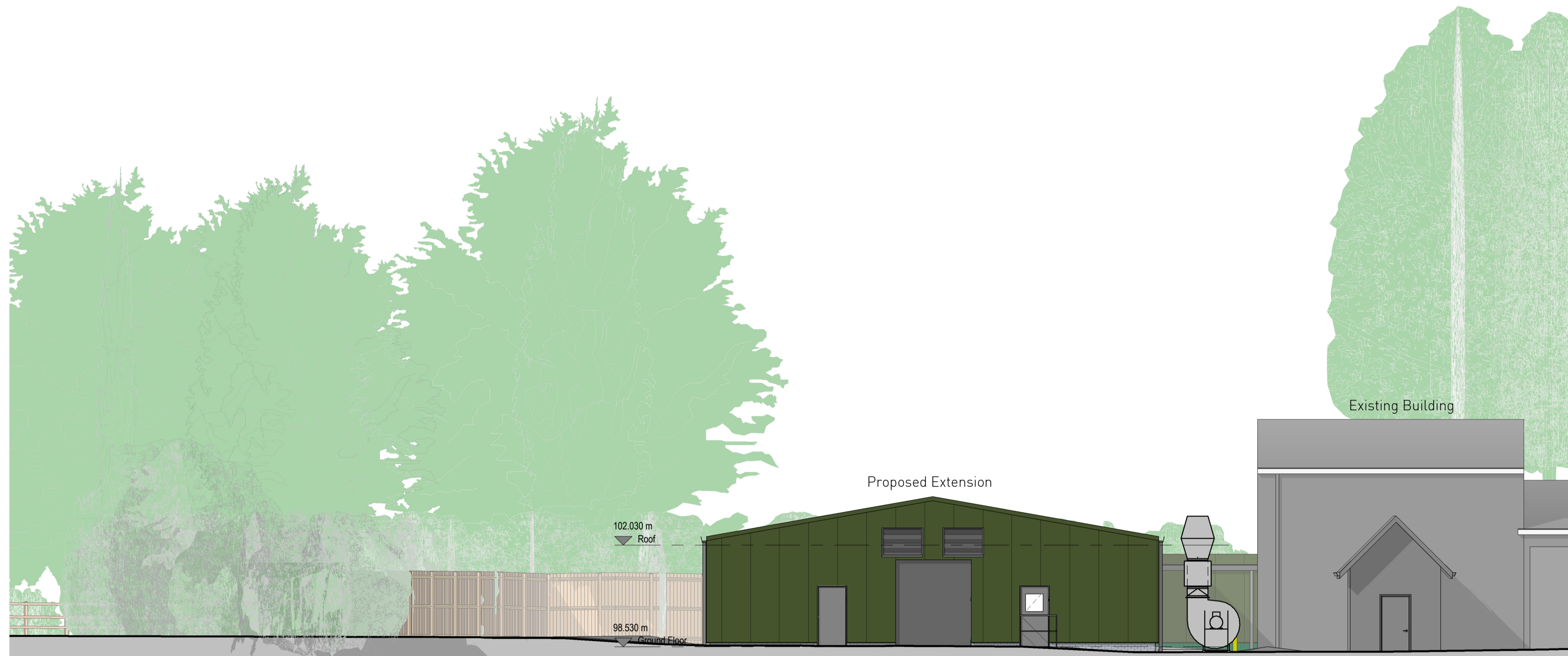
South West Elevation 1 : 100