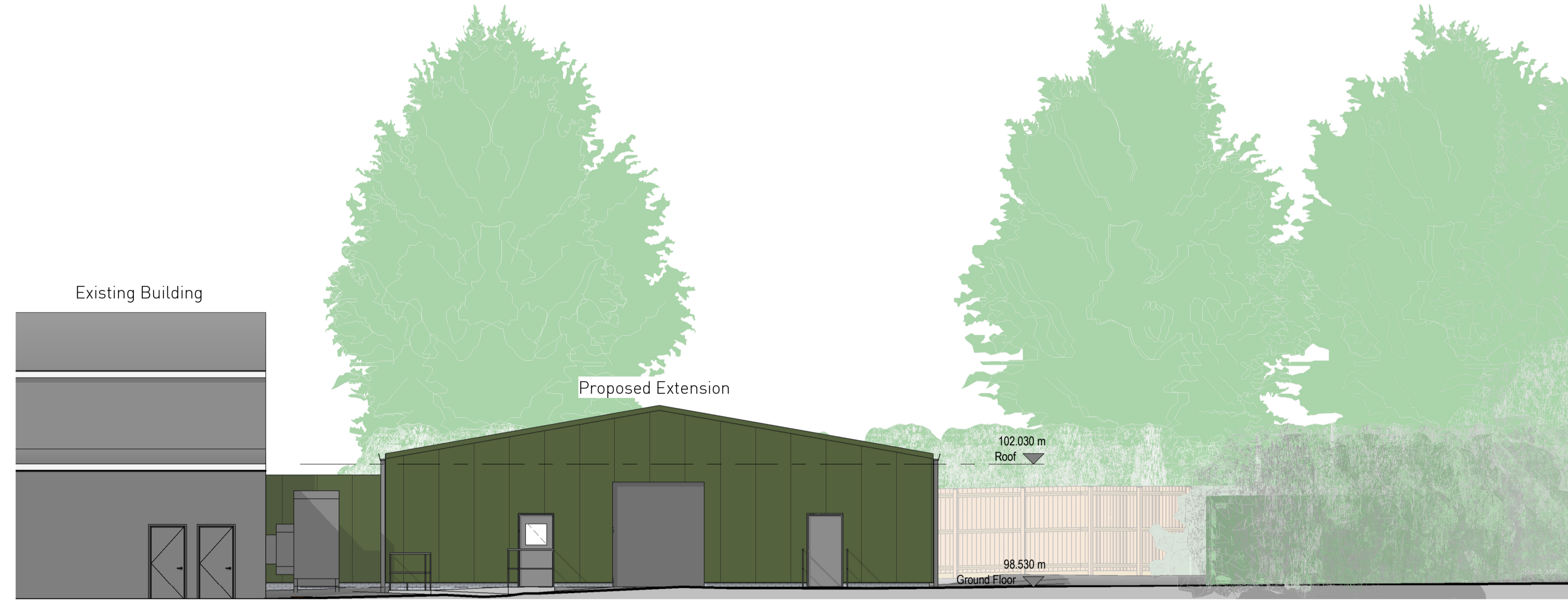
North East Elevation 1 : 100