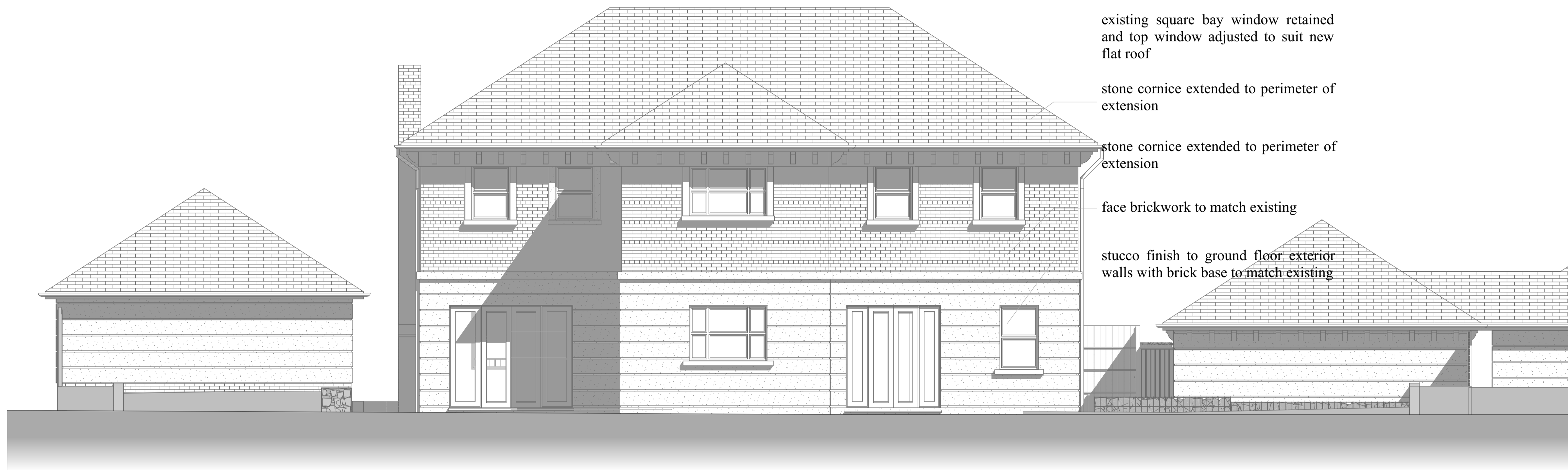
Elevation C - C