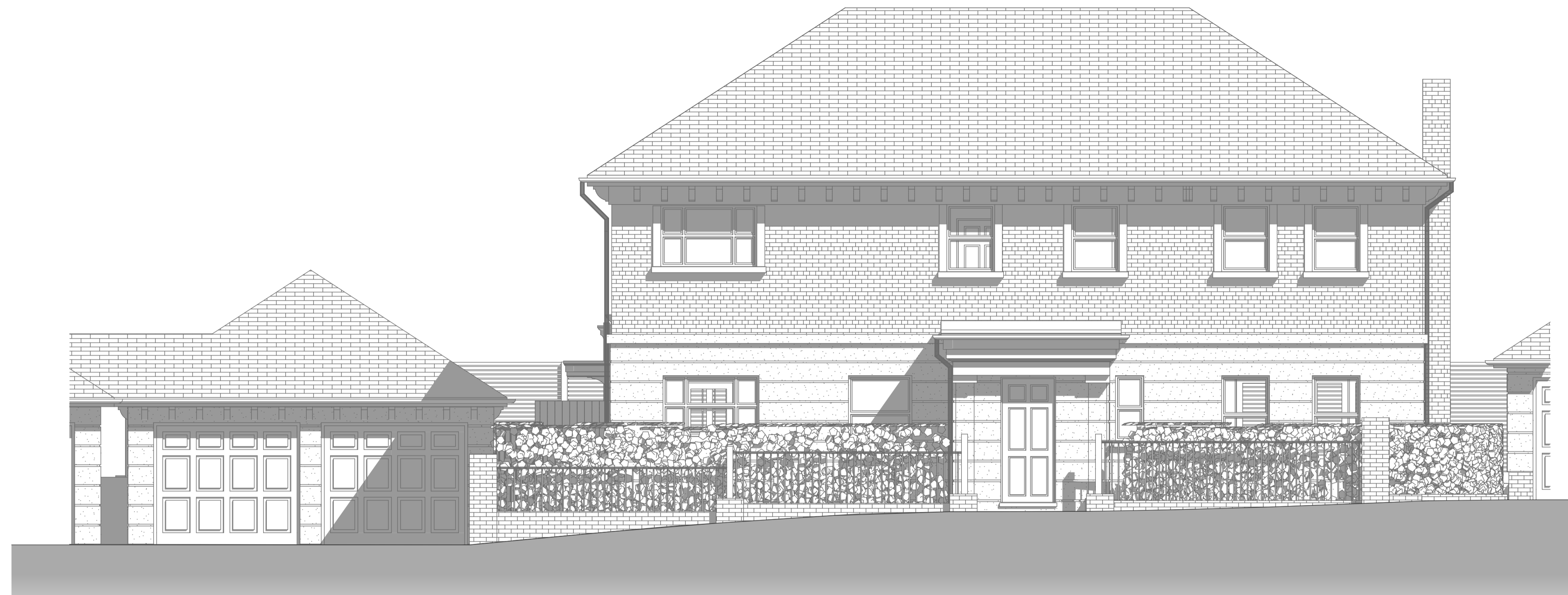
Elevation A - A