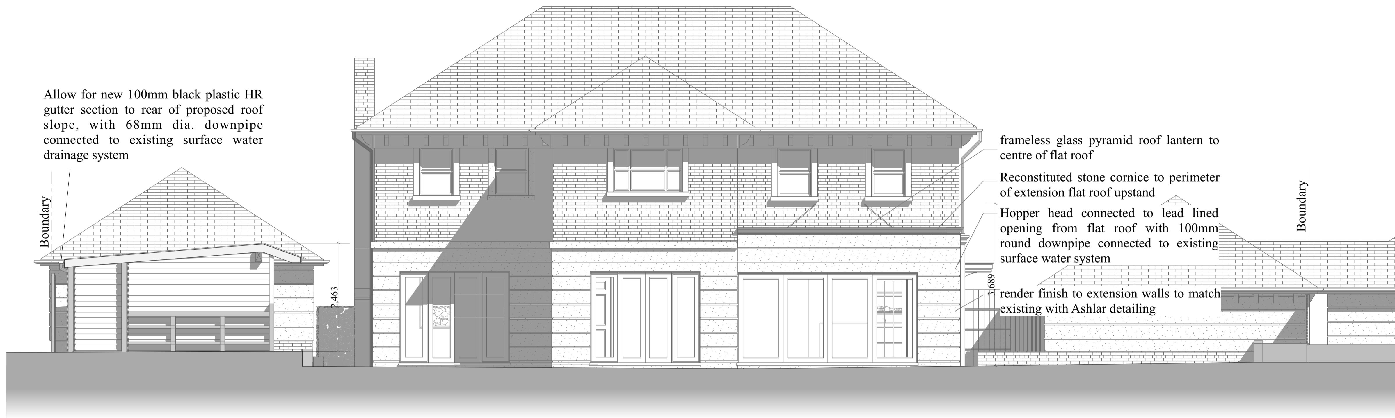
Elevation C - C

NOTES: These drawings are for Building Regulations and construction purposes. The Contractor is directly responsible for verifying all dimensions and material sizes / weights / lengths and clearances from property boundary - prior to commencement / ordering materials.