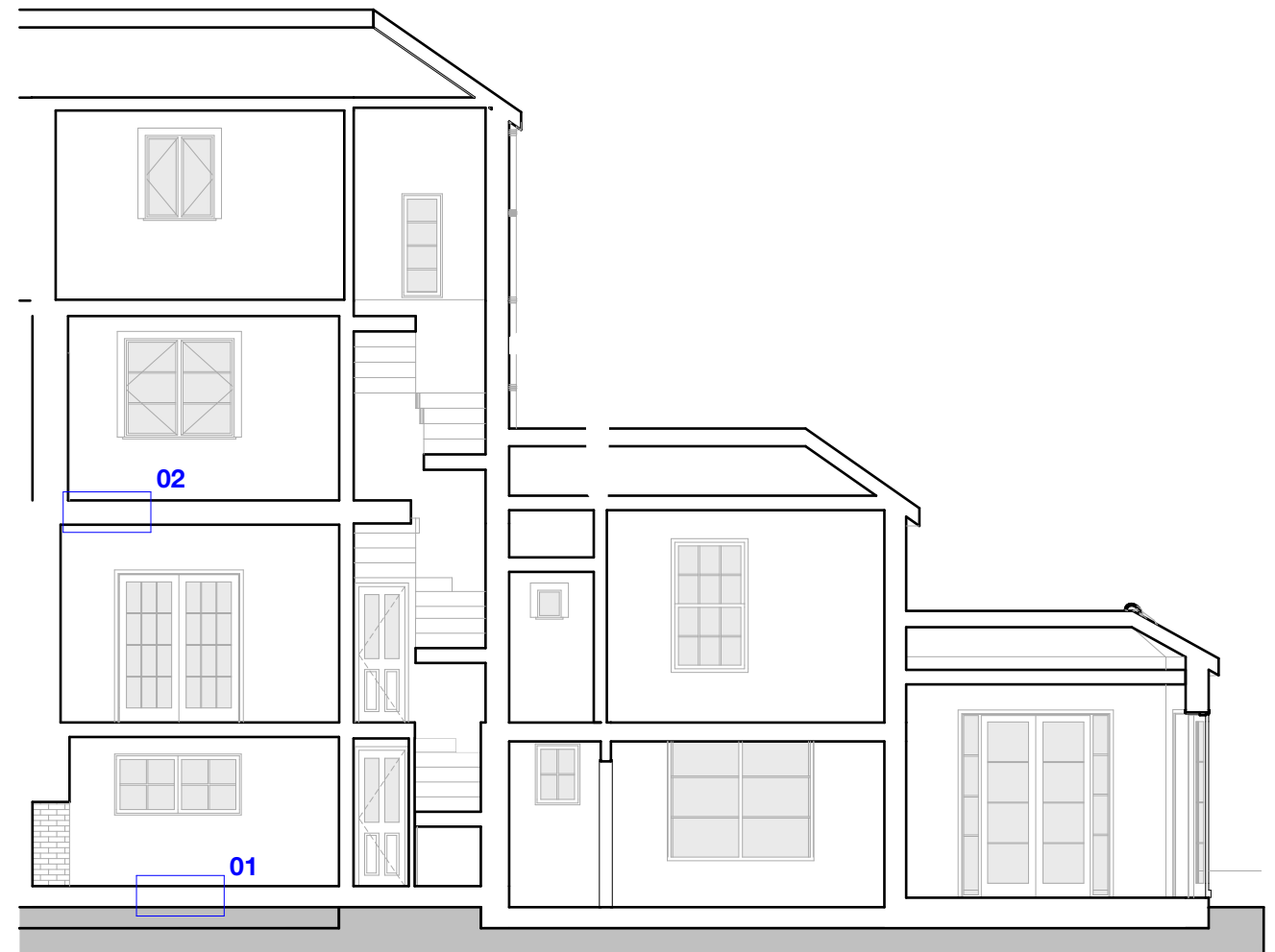
Key Plan: Section A 1:100