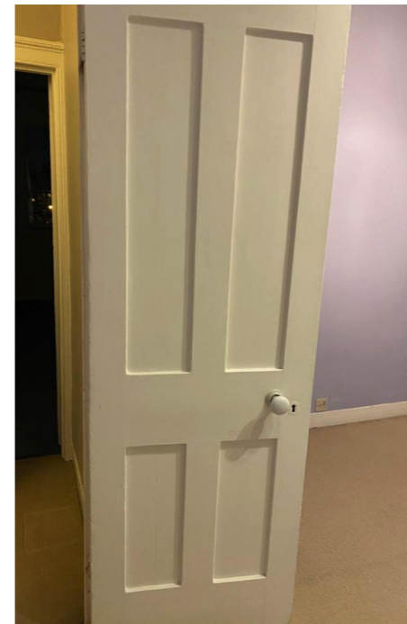
Existing door leaf: Inside view Site photograph