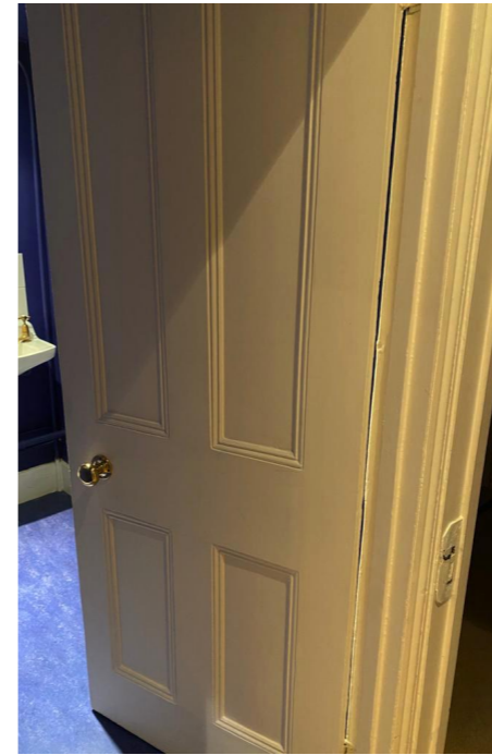
Existing door leaf: Outside view Site photograph