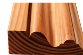
Architrave Image Not to scale