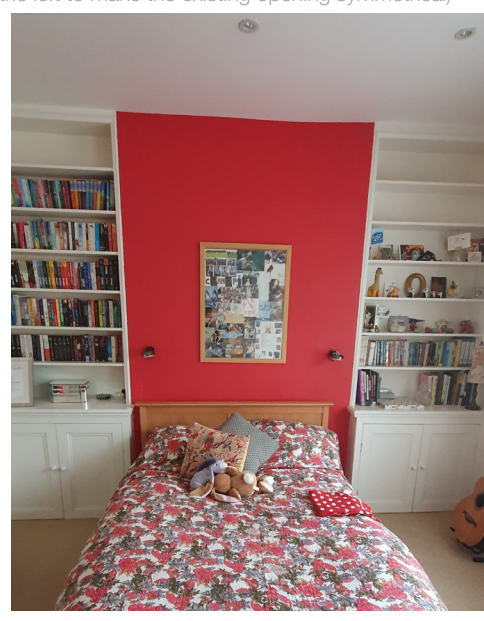
GF existing Bedroom with blocked-up chimney-breast