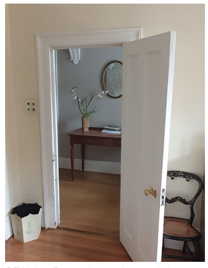
GF Living-Room door to be fixed shut