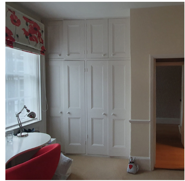
GF front bedroom