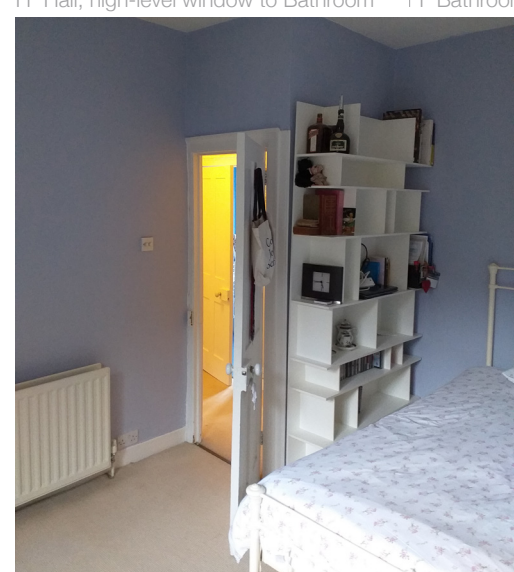
SF Bedroom 01