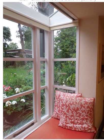
Modern bay window (2012) to LGF Kitchen