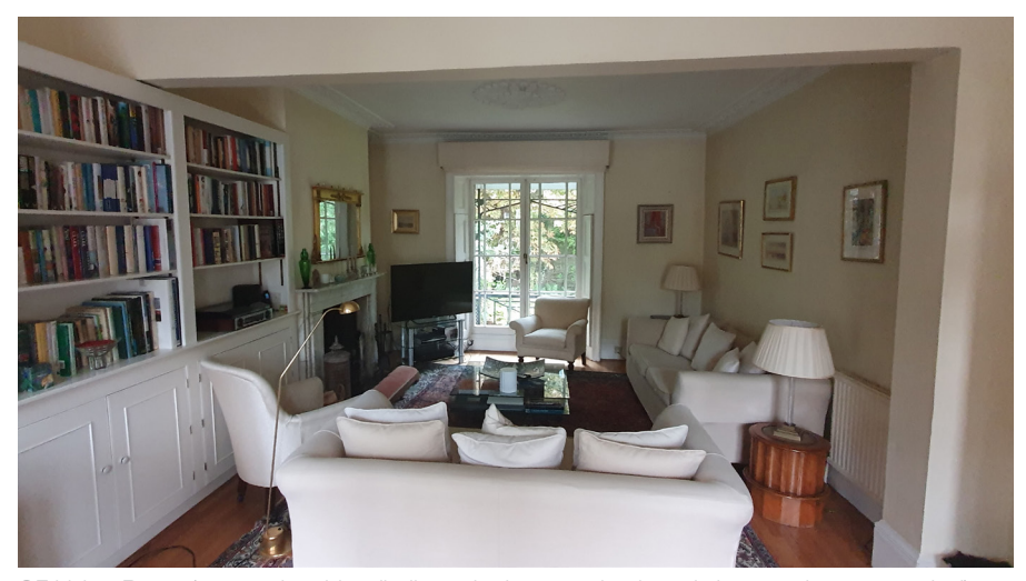
GF Living-Room (proposals add wall-nib on the left to make the existing opening symmetrical)