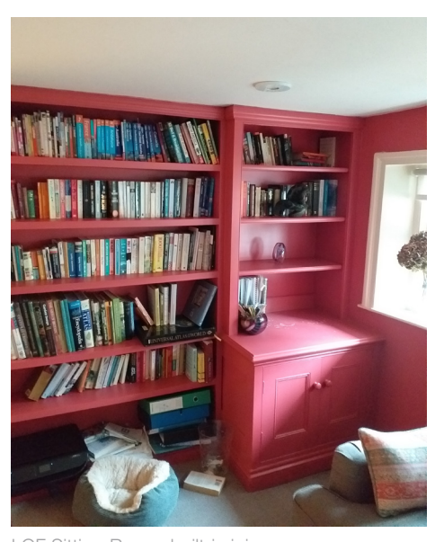
LGF Sitting-Room; built-in joinery