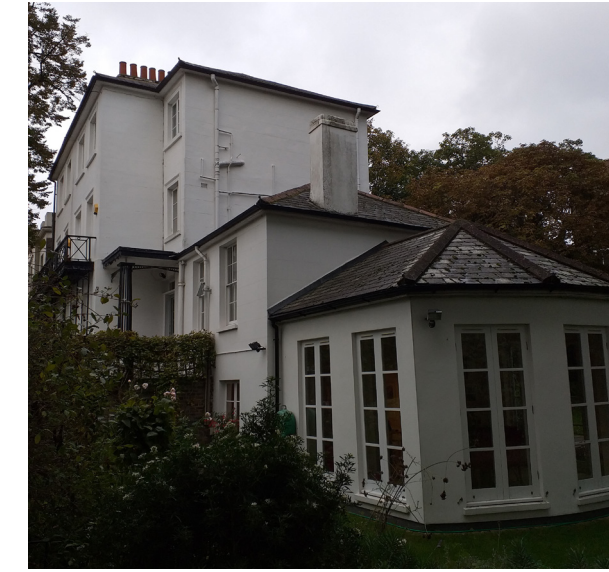
Side view showing Victorian extension & modern conservatory