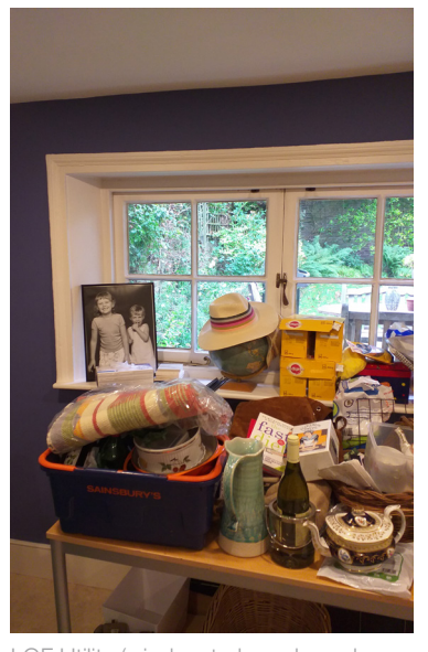
LGF Utility (window to be enlarged