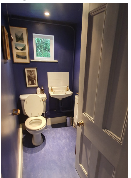
GF existing WC with high-level window