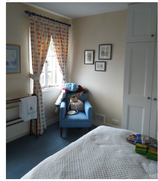
SF Bedroom 02