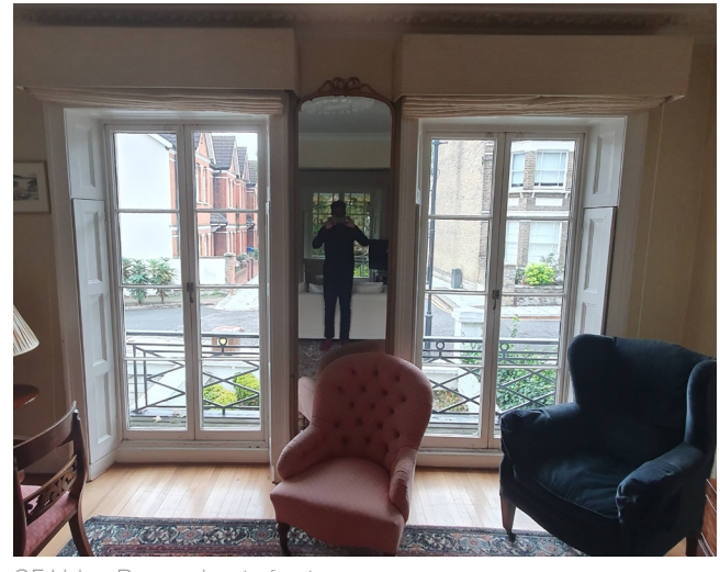
GF Living-Room; view to front