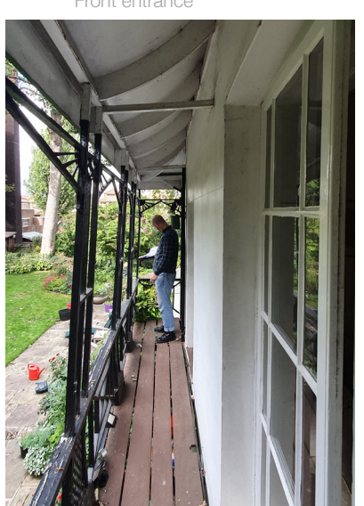
Rear balcony (GF level)