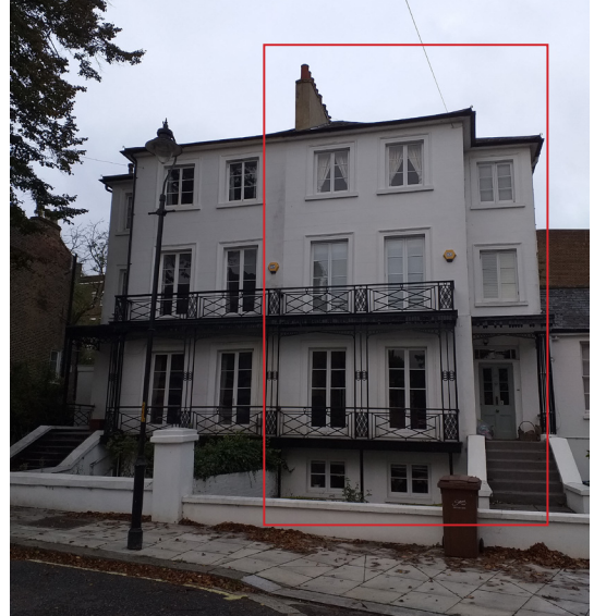
Front elevation from Champion Grove.