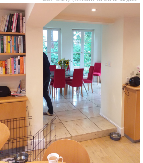
View from Kitchen to Dining-Room