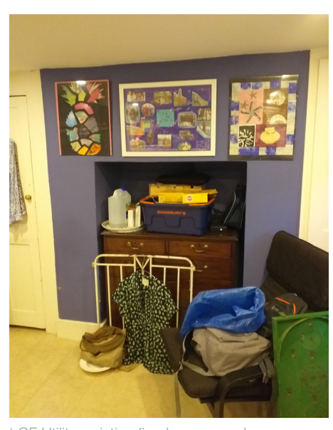
LGF Utility; existing fireplace opened up