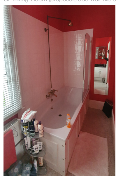
GF existing Bathroom