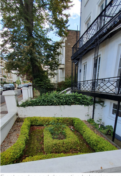
Front garden and decorative balconies over