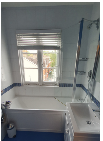
SF Front Bathroom