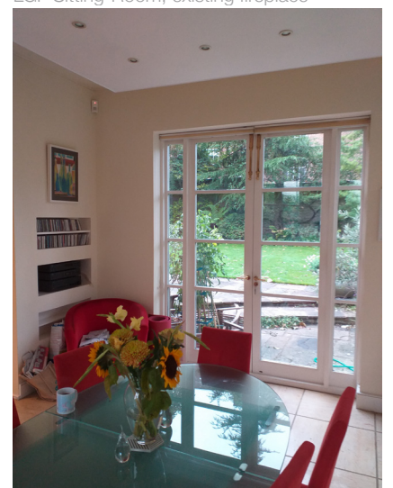
LGF Dining-Room (modern conservatory) with suspended ceiling