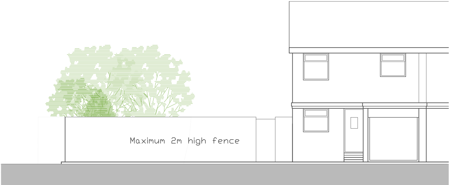
Proposed Elevation Front 1:100