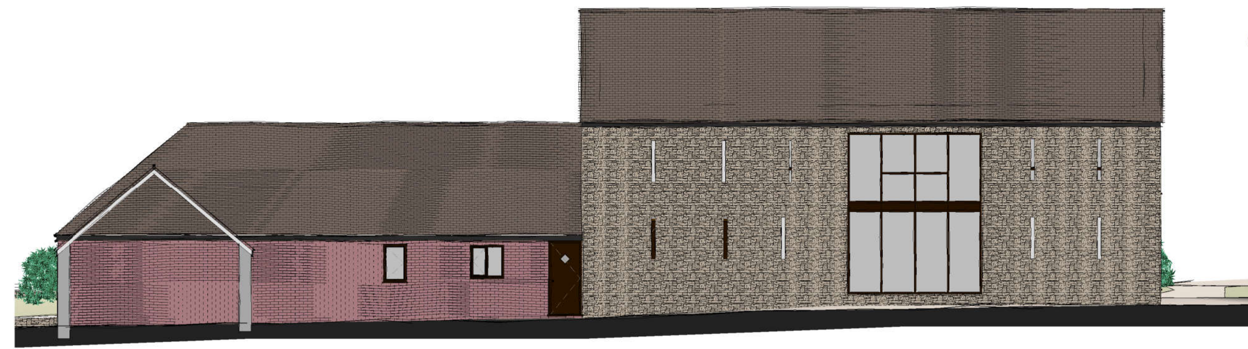
South Elevation. 1 : 100