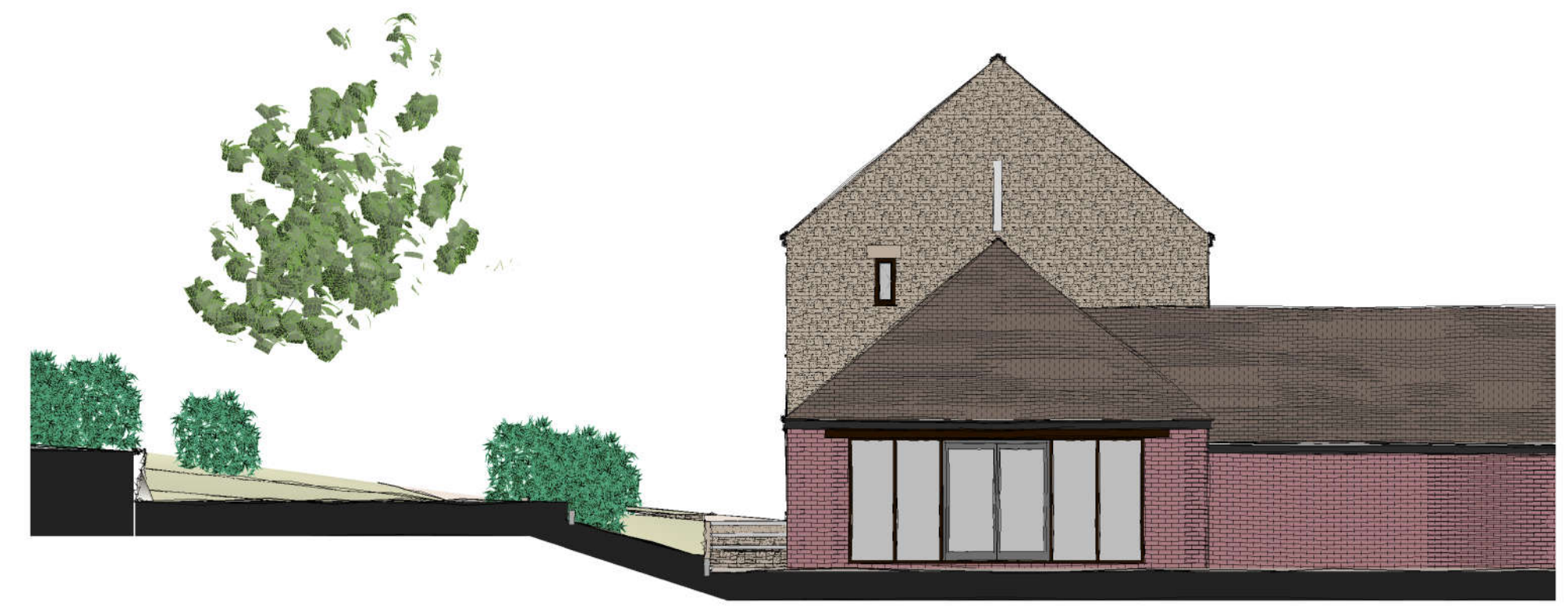
West Elevation. 1 : 100