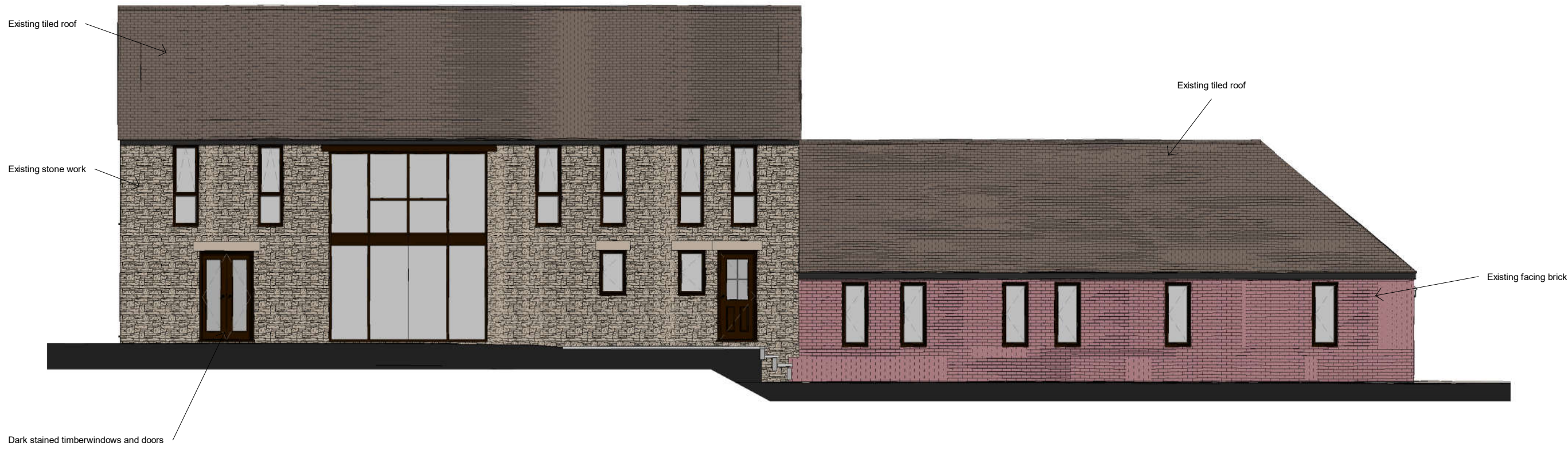
North Elevation. 1 : 100