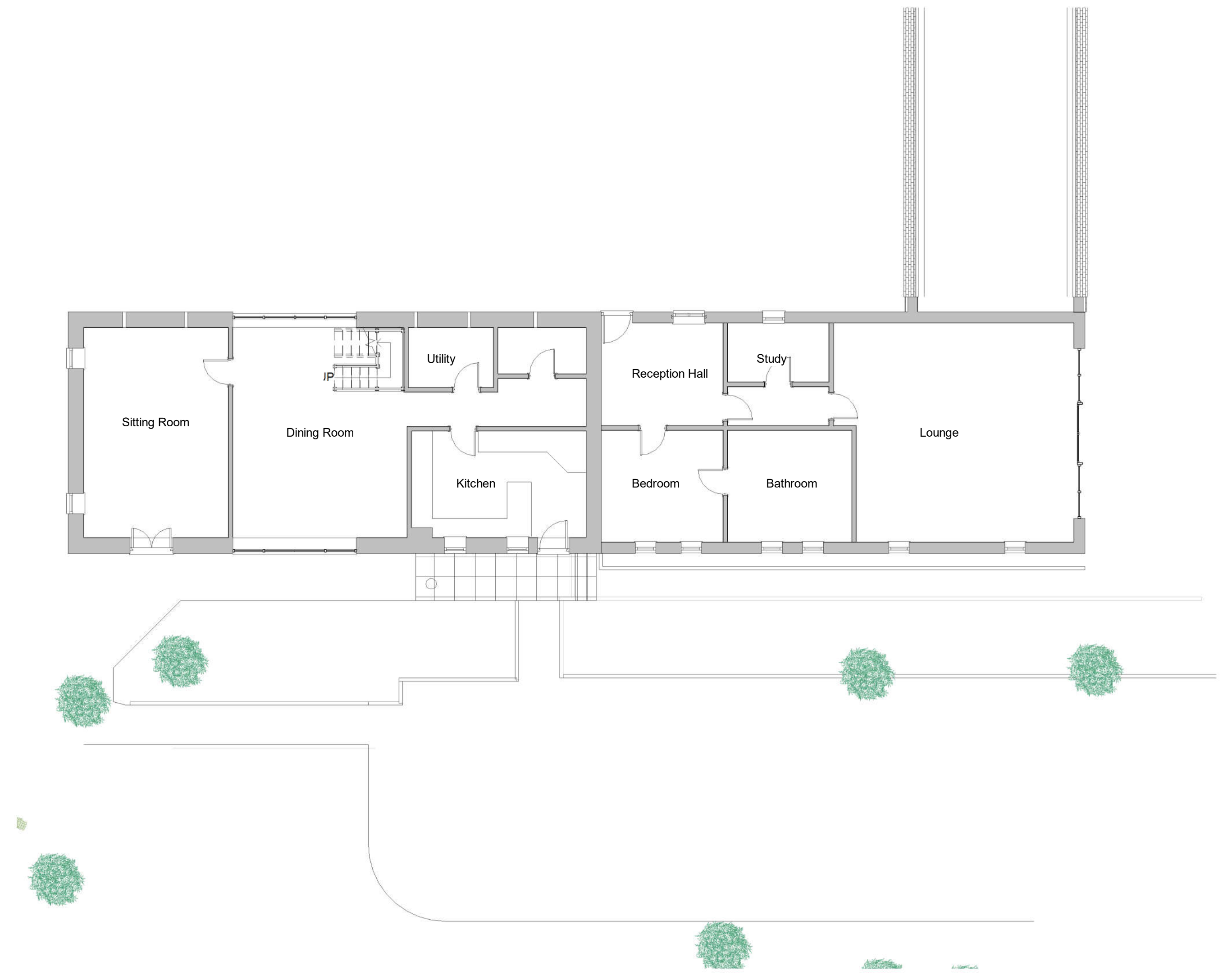
Ground Floor Plan. 1 : 100