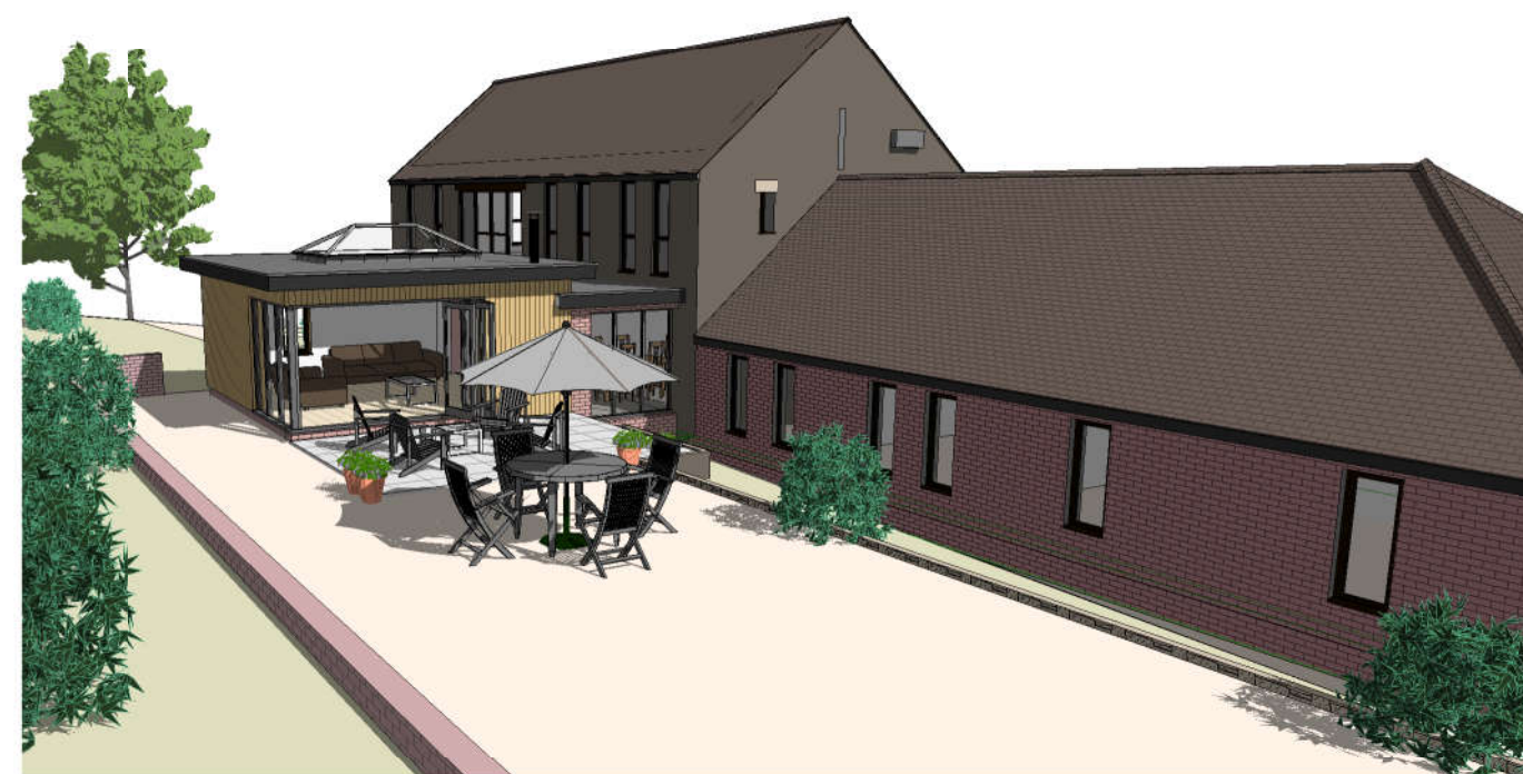
3D View 1