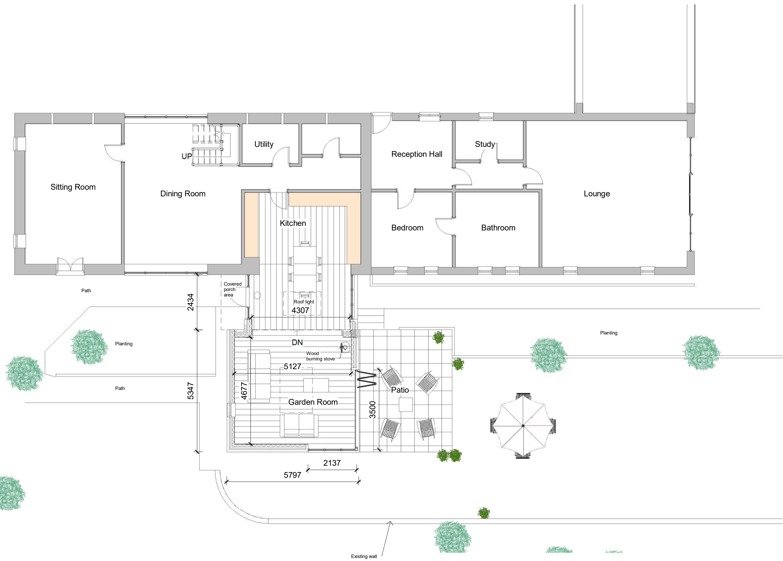
Ground Floor Plan. 1 : 100