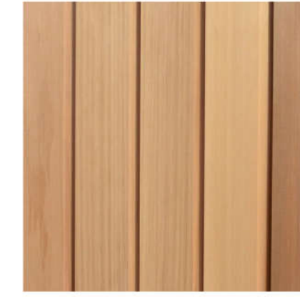
Vertical Larch or Cedar timber cladding.