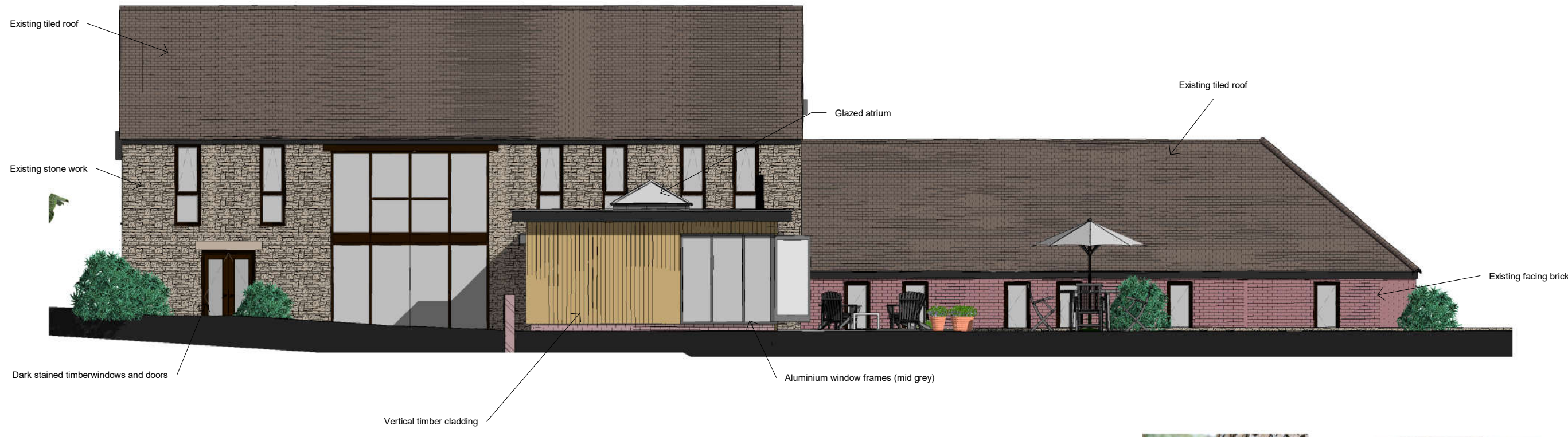
North Elevation. 1 : 100