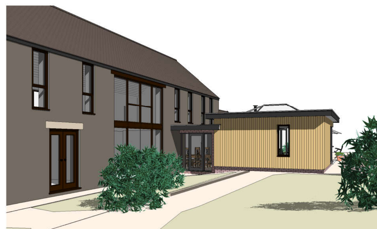
3D View 2