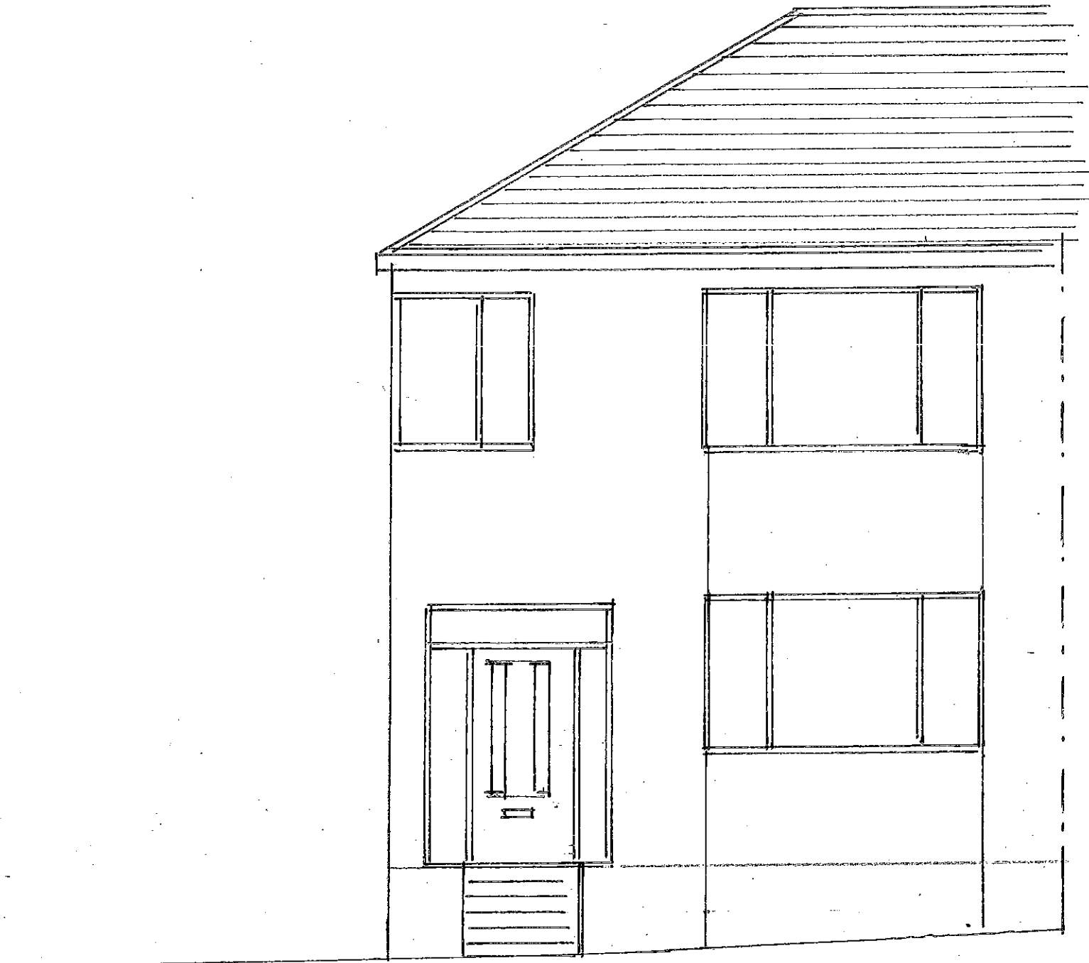
EXISTING FRONT ELEVATION 1:50 @ A3