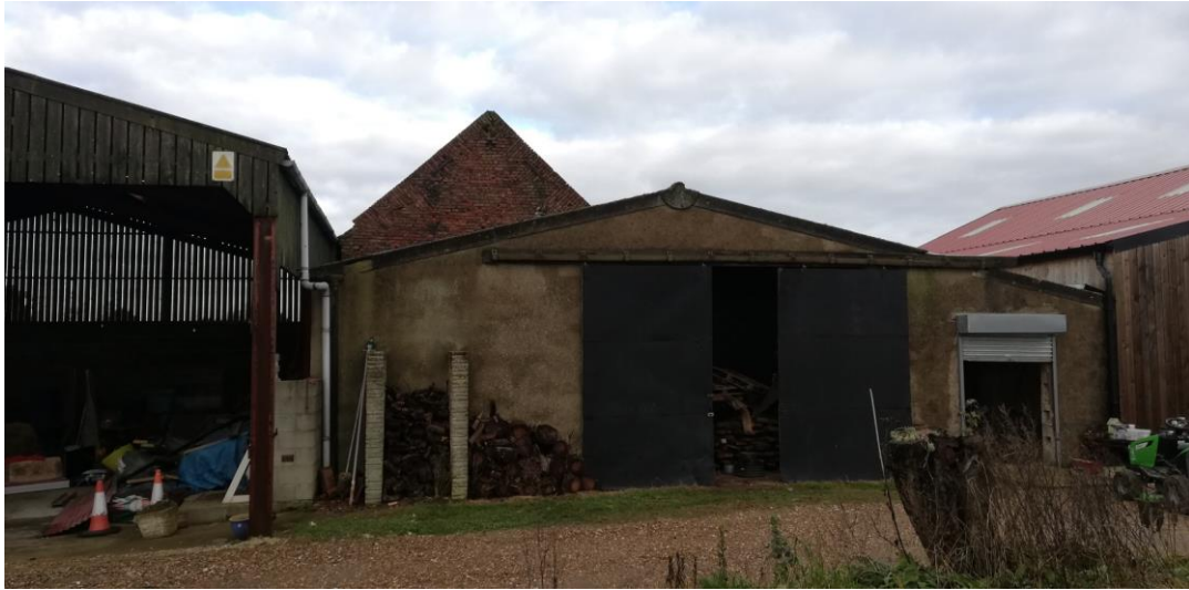
Exterior View from South