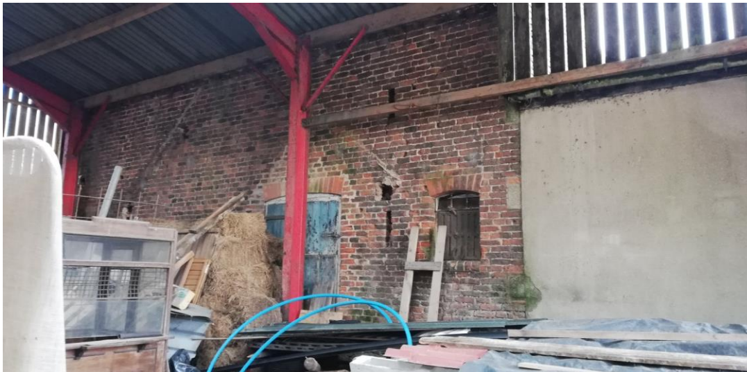
West Elevation viewed from within adjacent Barn