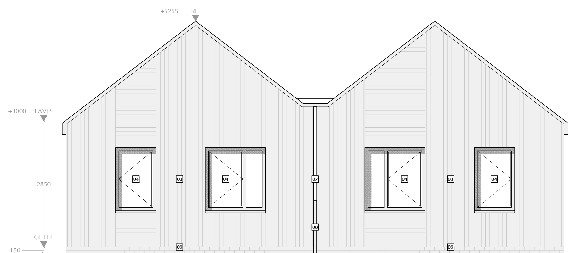
A - Front Elevation