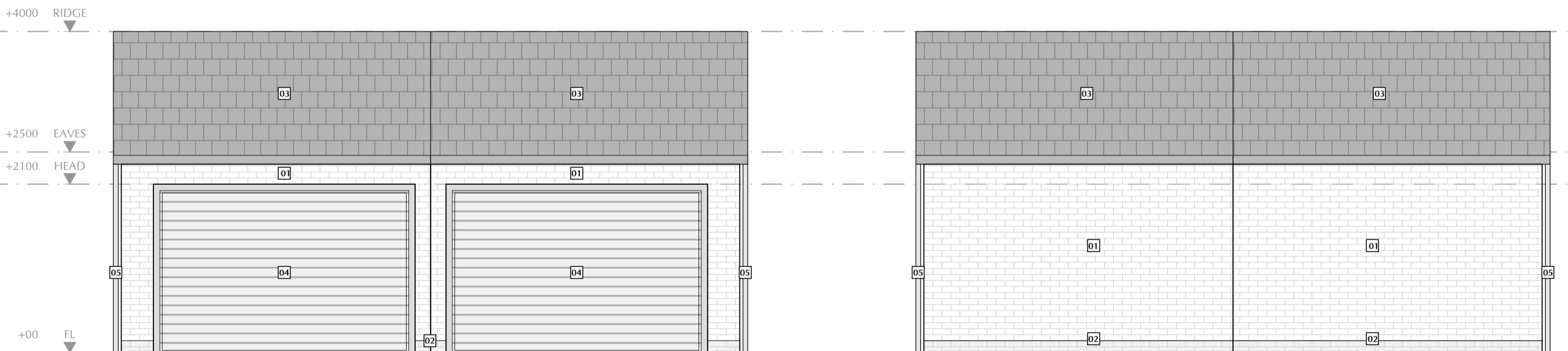
01 Garage Front & Rear Elevations