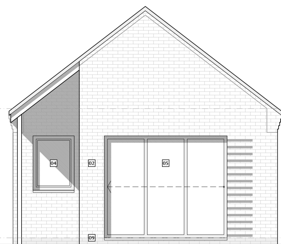
B - Rear Elevation