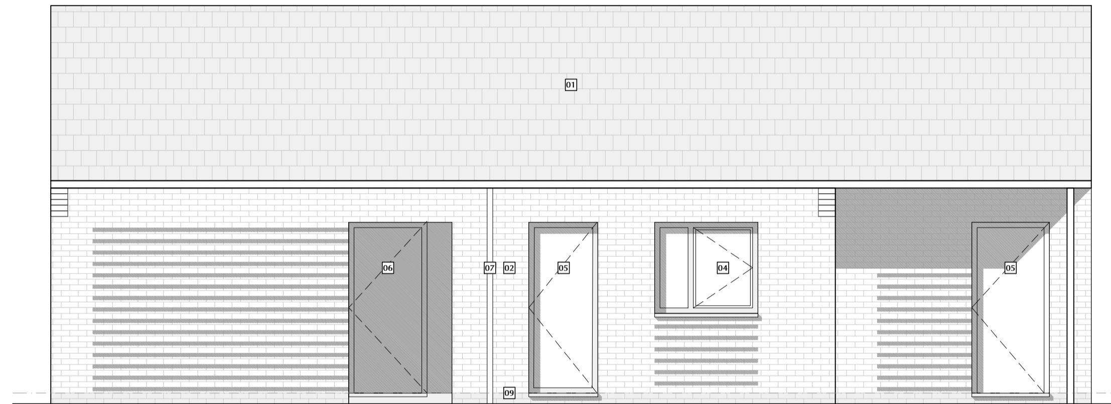
D - Side (Short) Elevation