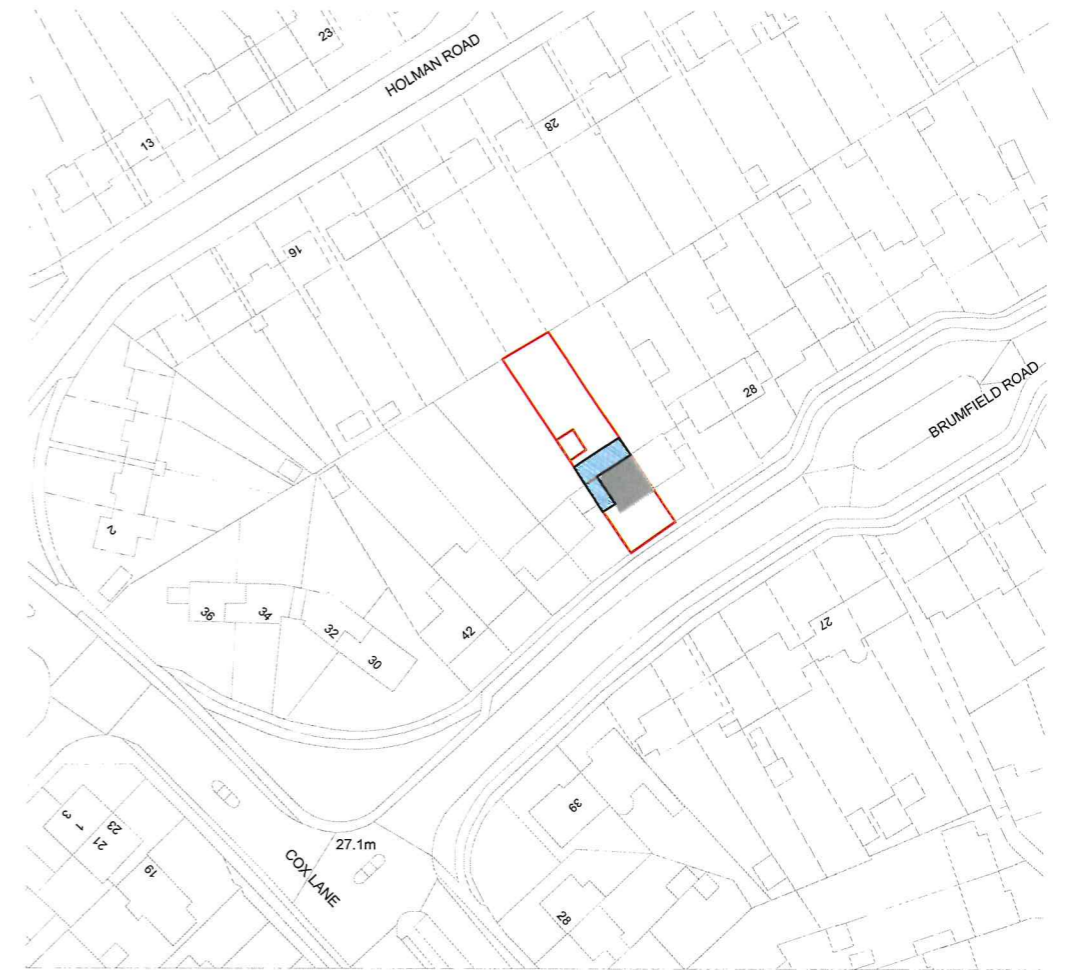
Site Plan - Scale: 1:1250