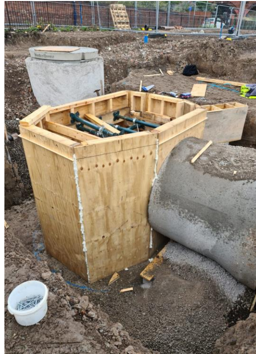
Internal and external photographs chamber S7, containing the Hydro-Brake. Constructed in accordance with Carley Daines and Partners drawings and Hydro International.