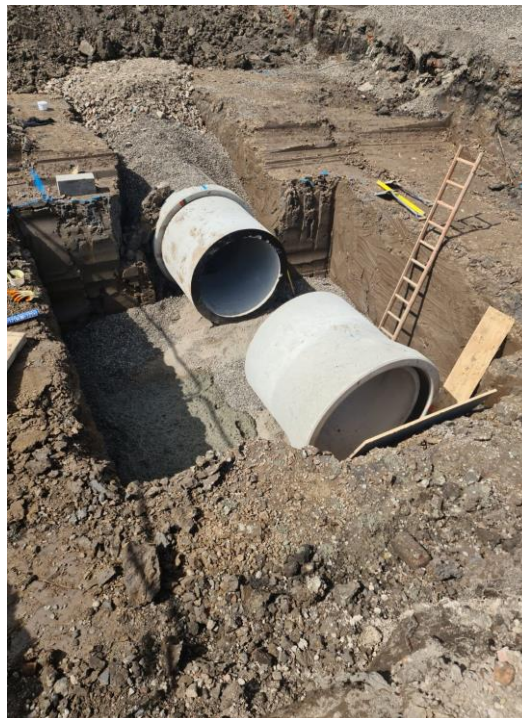
Photographs showing the construction of private (L) and adoptable (R) drainage runs confirm drainage was laid in accordance with Building Regulations Document H, and to Sewers For Adoption standards. Also per the detailed construction design shown on Carley Daines and Partners drawings.

Principal: D.J. Middleton BEng(Hons) CEng MStructE Company Number: 11006567 Address 11 Bridgewater Road, Walkden, Worsley, Manchester M28 3JE VAT Number: 285 0439 91