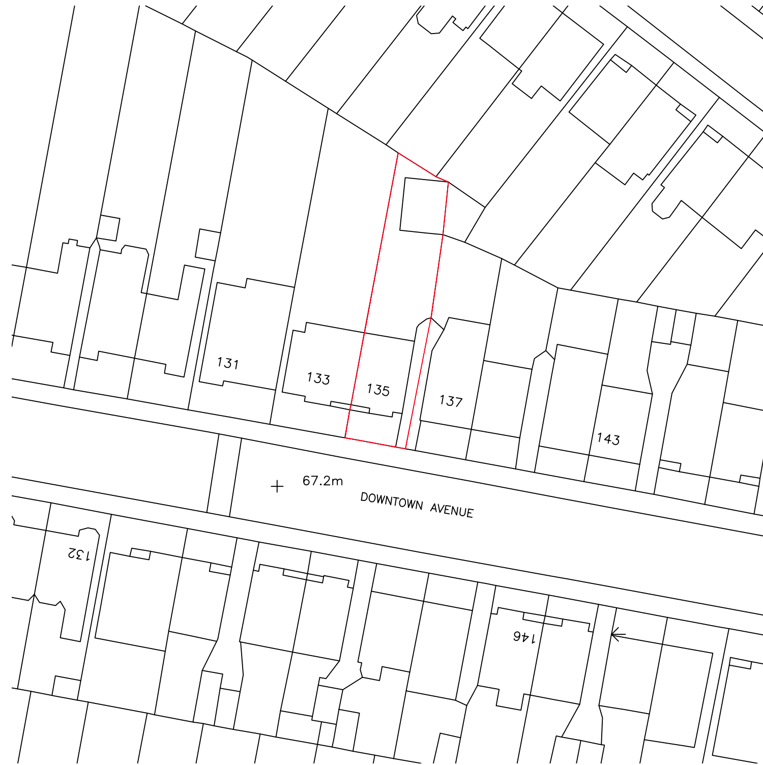
1 Site Location Plan Scale 1:500