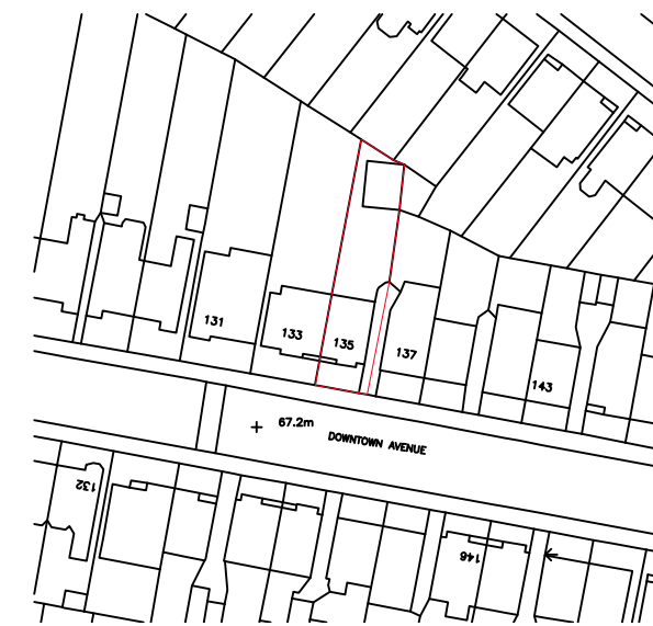
2 Site Location Plan Scale 1:1250