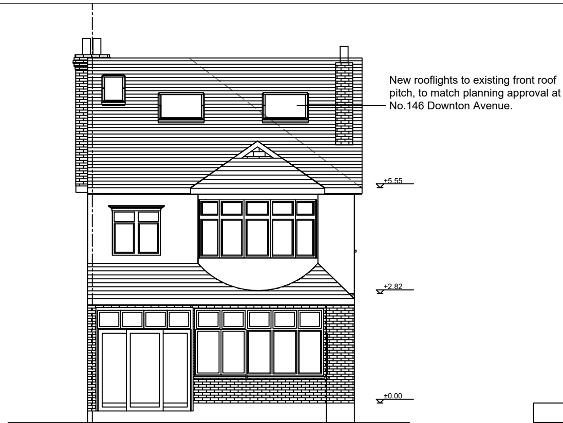
1 Front Elevation Scale 1:100