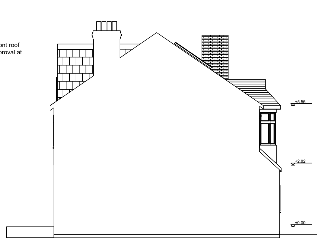
2 Side Elevation (Party Wall) Scale 1:100