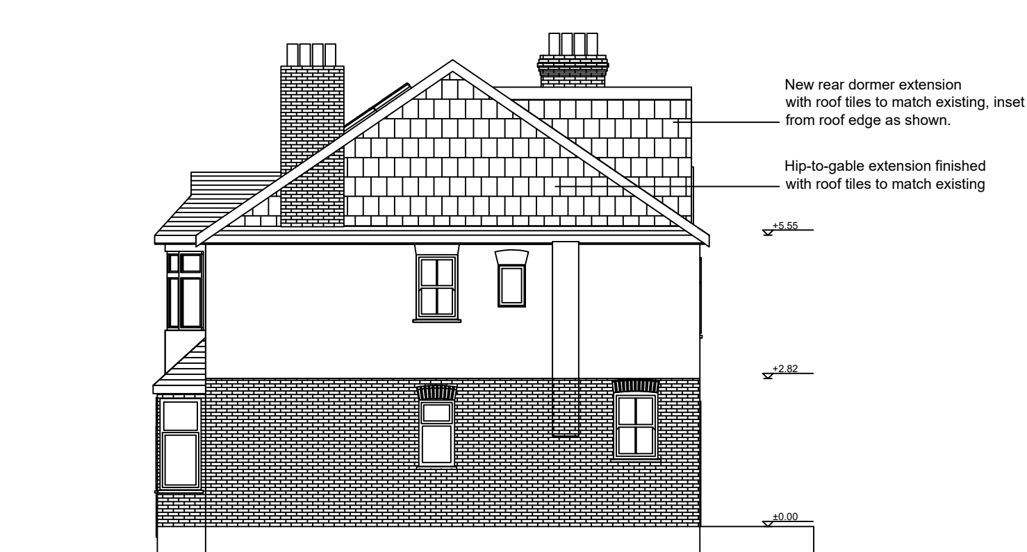
3 Side Elevation Scale 1:100