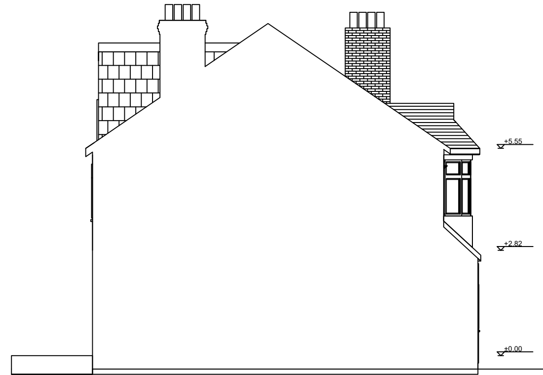
2 Side Elevation (Party Wall) Scale 1:100