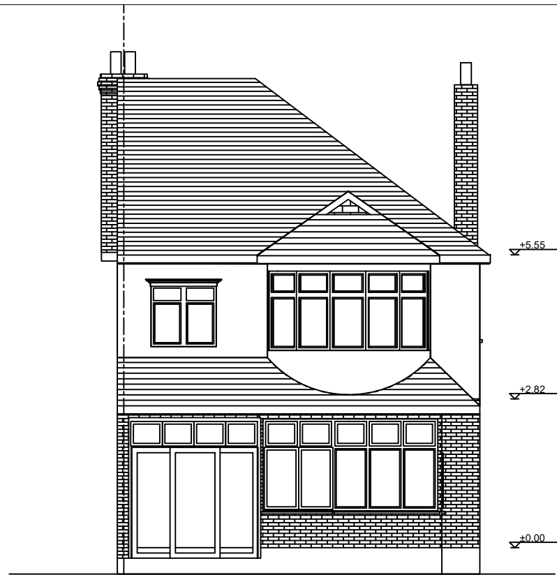
1 Front Elevation Scale 1:100