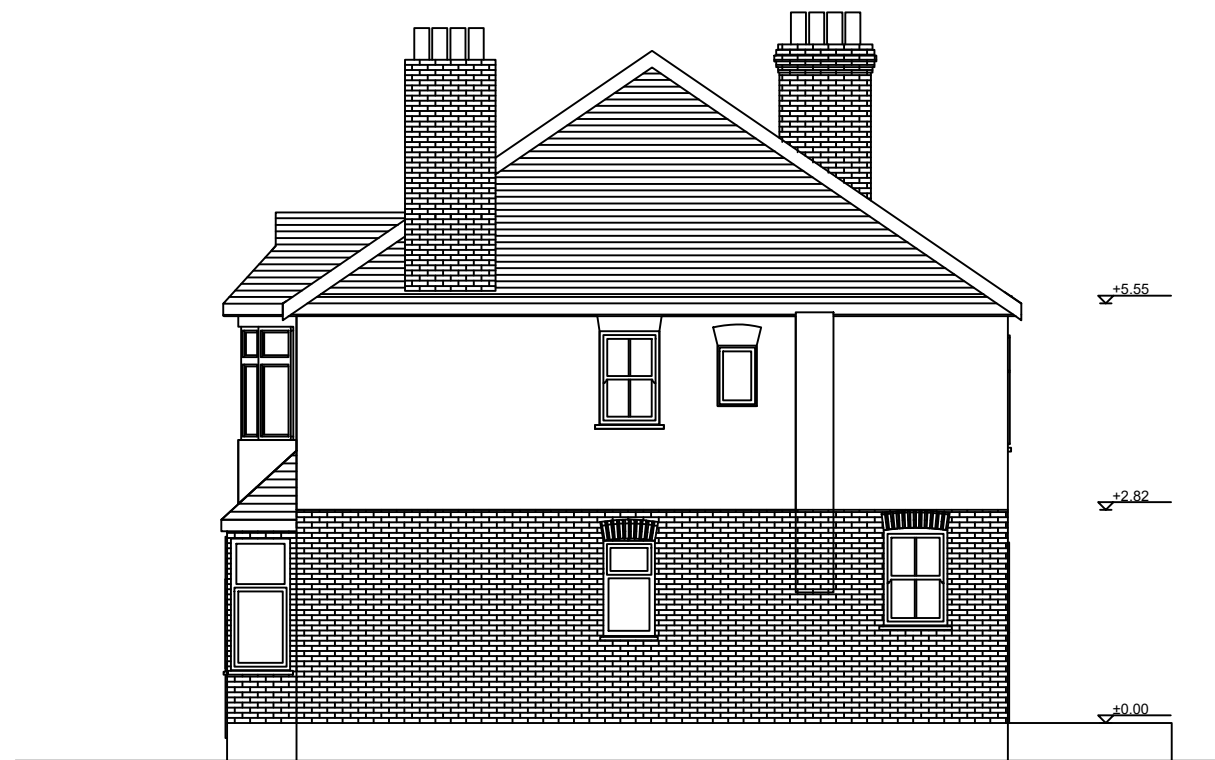
3 Side Elevation Scale 1:100