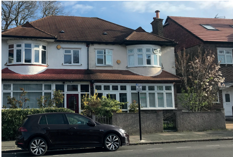
1. Existing front elevation