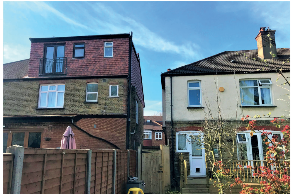
2. View from rear of existing roof extension at neighbouring property at No.137 Downton Avenue