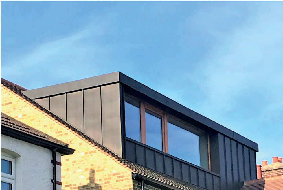
3. View of existing rear roof extensions and rear dormer at neighbouring property at No.131 Downton Avenue