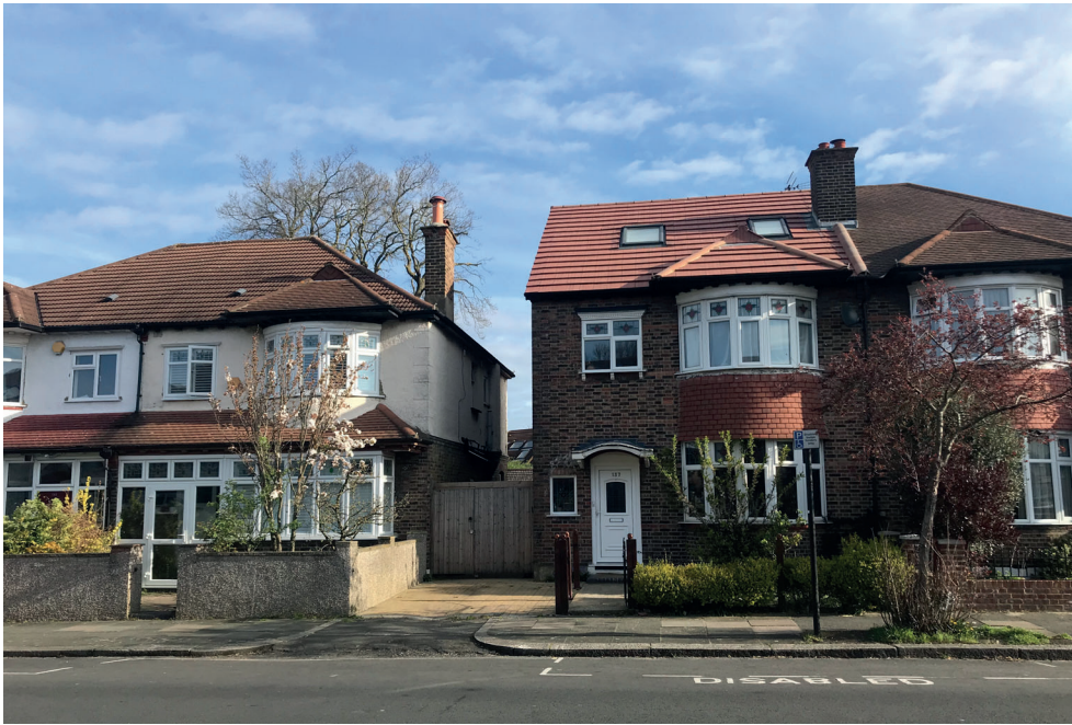
1. View of front of house and existing roof extension at neighbouring property at No.137 Downton Avenue