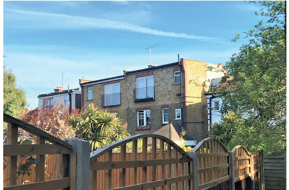
4. View looking north towards existing rear roof extensions on Wavertree Road to rear of site