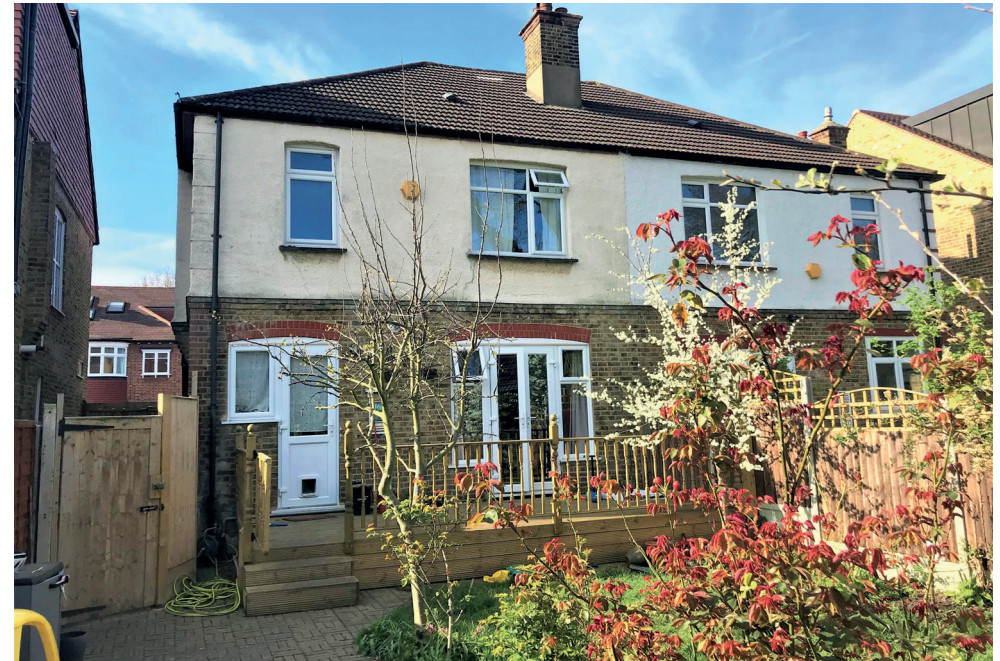
2. Existing rear elevation