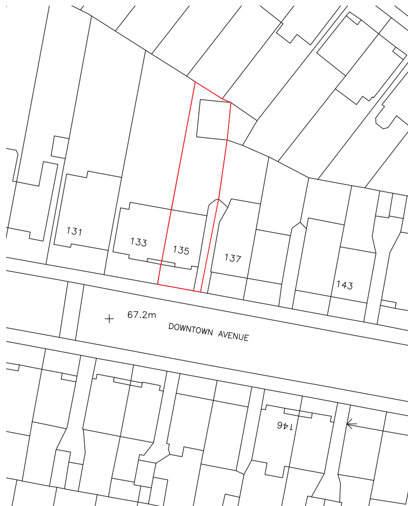
1. Site Location Plan