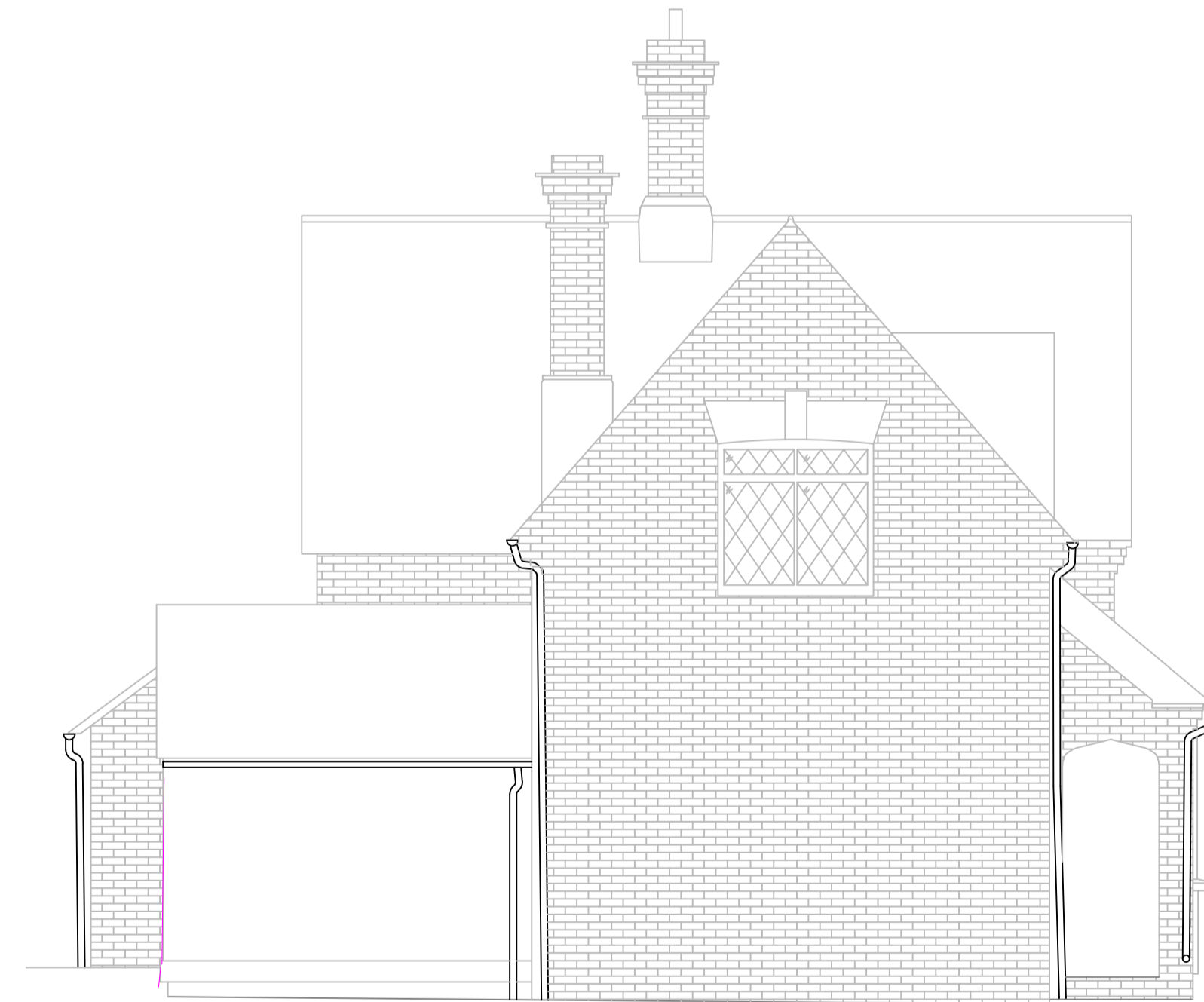
NORTH ELEVATION (Facing A272)

New rainwater goods and soil pipe to be cast iron painted black