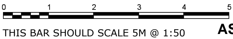
AS EXISTING FIRST FLOOR PLAN - 1:50