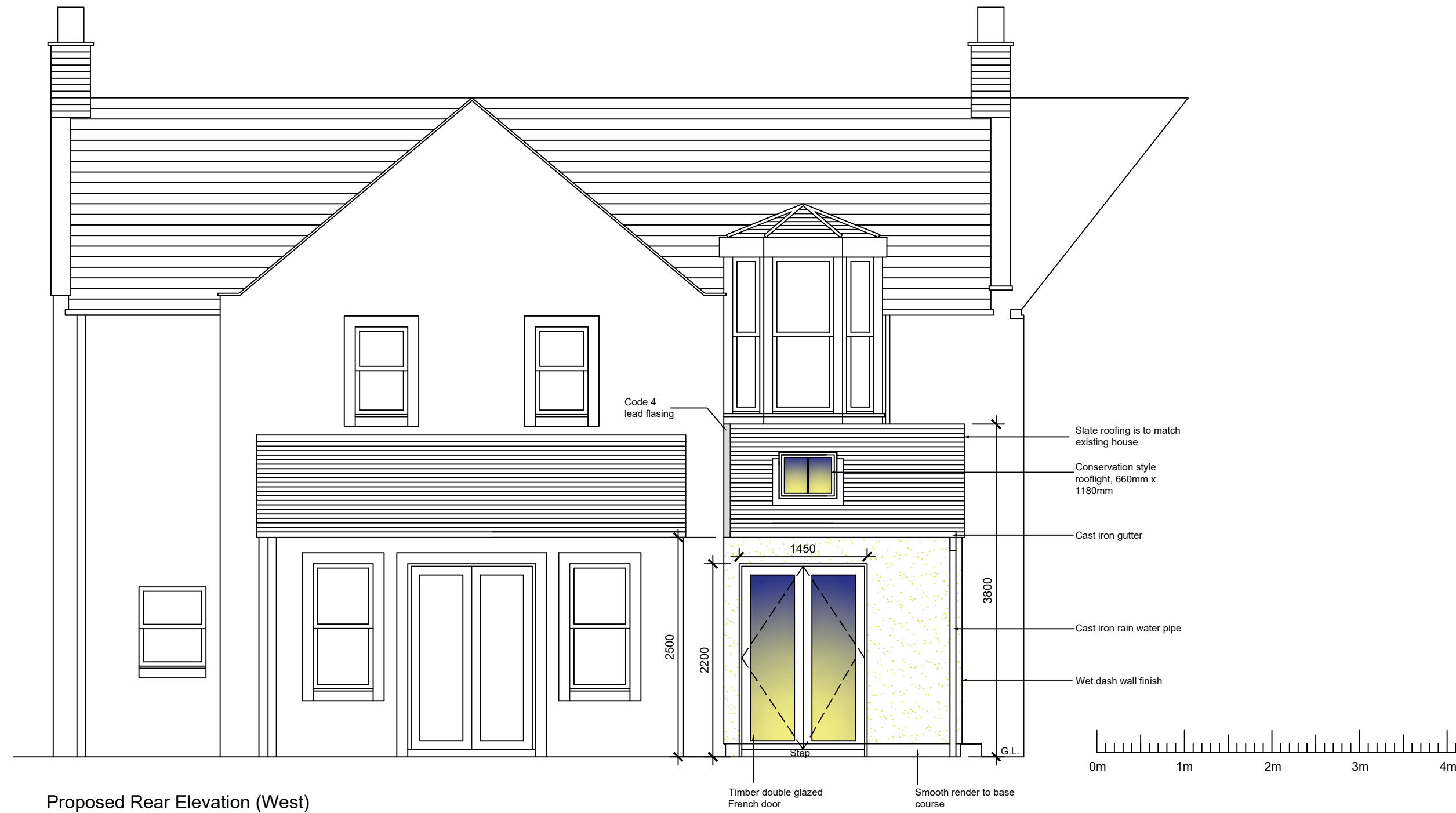
Proposed Rear Elevation (West) Scale 1:50

Copyright: All rights reserved. This drawing must not be reproduced without permission. This drawing must not be scaled. Main contractor to check all dimensions. Construction or manufacturer of components not to be carried out if Main contractor has doubt regarding dimension. Contact designer immediately. Dimensions are in millimetres unless otherwise specified. These drawings are for Planning and Building Warrant Submissions only.