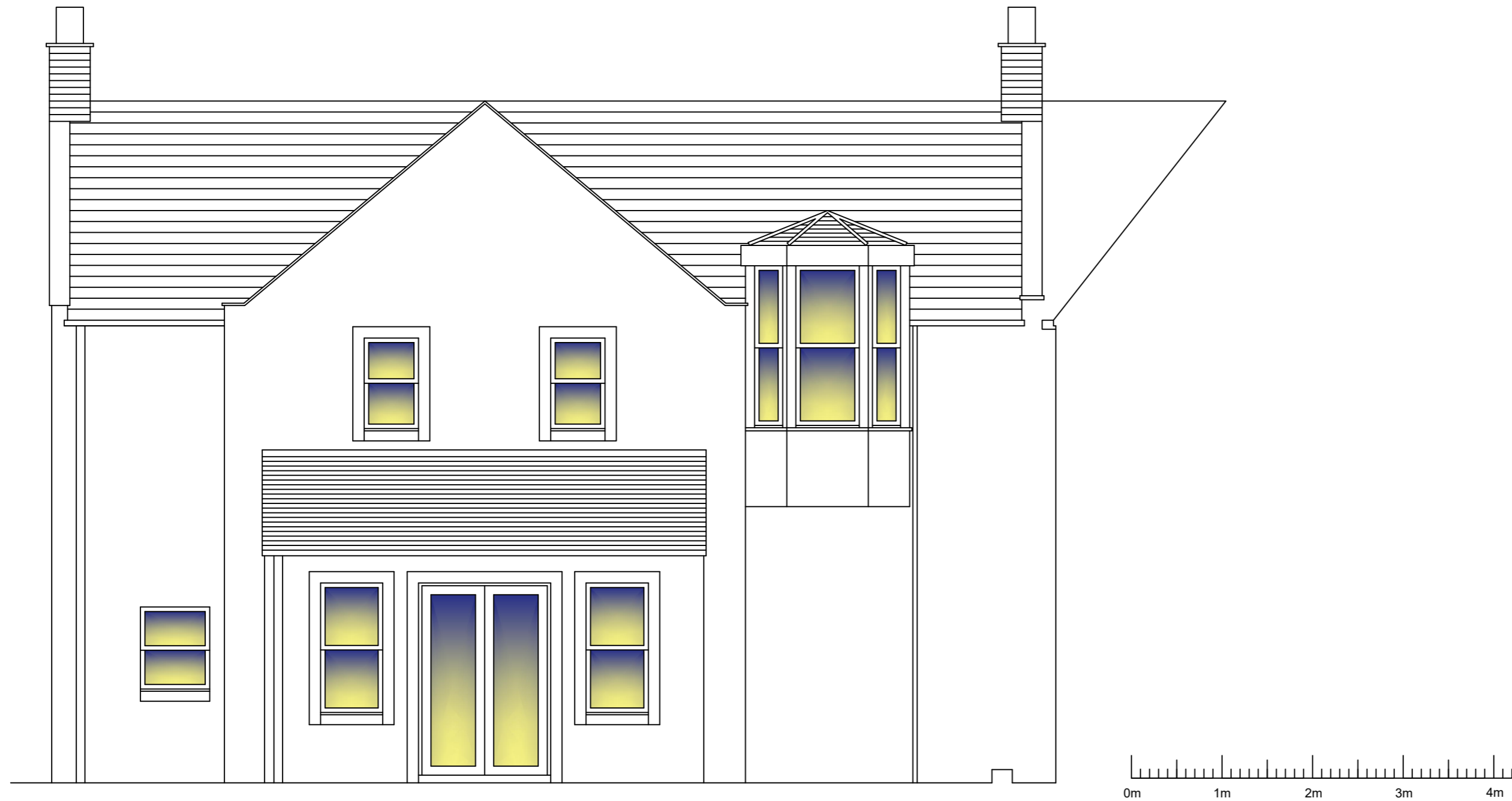
Existing Rear Elevation (West) Scale 1:50

Copyright: All rights reserved. This drawing must not be reproduced without permission. This drawing must not be scaled. Main contractor to check all dimensions. Construction or manufacturer of components not to be carried out if Main contractor has doubt regarding dimension. Contact designer immediately. Dimensions are in millimetres unless otherwise specified. These drawings are for Planning and Building Warrant Submissions only.