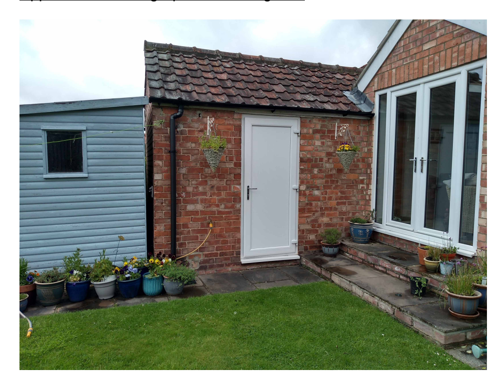
Photograph 1: Existing side elevation of garage, shed and rear elevation of enlarged single story outrigger. (Please see drawing number 1)