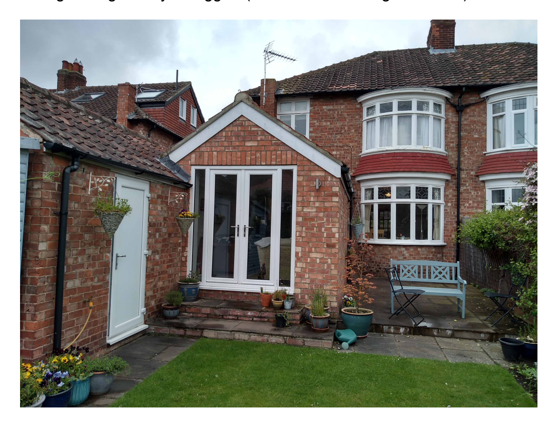
Photograph 2: Rear elevation of existing host building, including extended single story outrigger and side elevation of garage. (Please see drawing number 2)