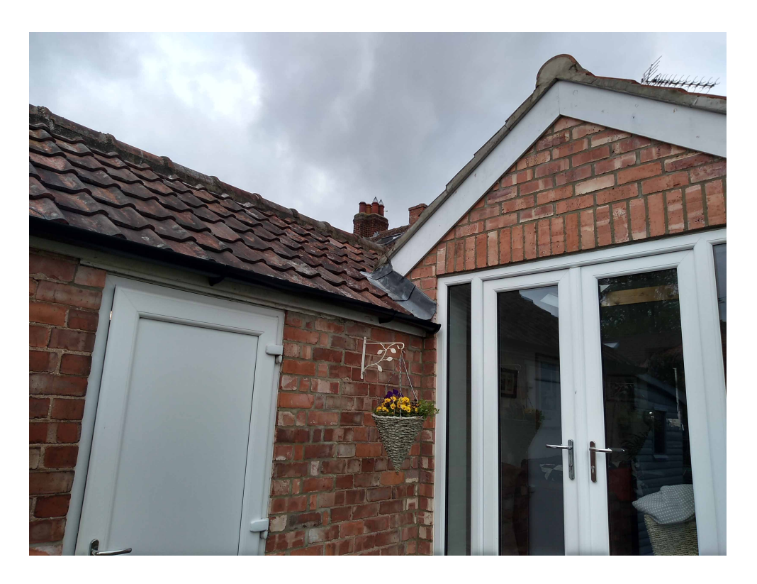
Photograph 3: Side elevation of existing garage and rear elevation of extension connected to outrigger (Please see drawing number 3)