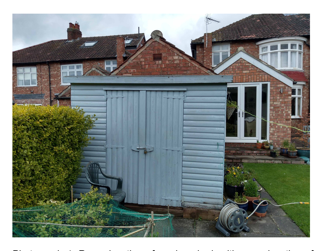
Photograph 4: Rear elevation of garden shed, with rear elevation of garage and single storey extension behind. (Please see drawing number 4)