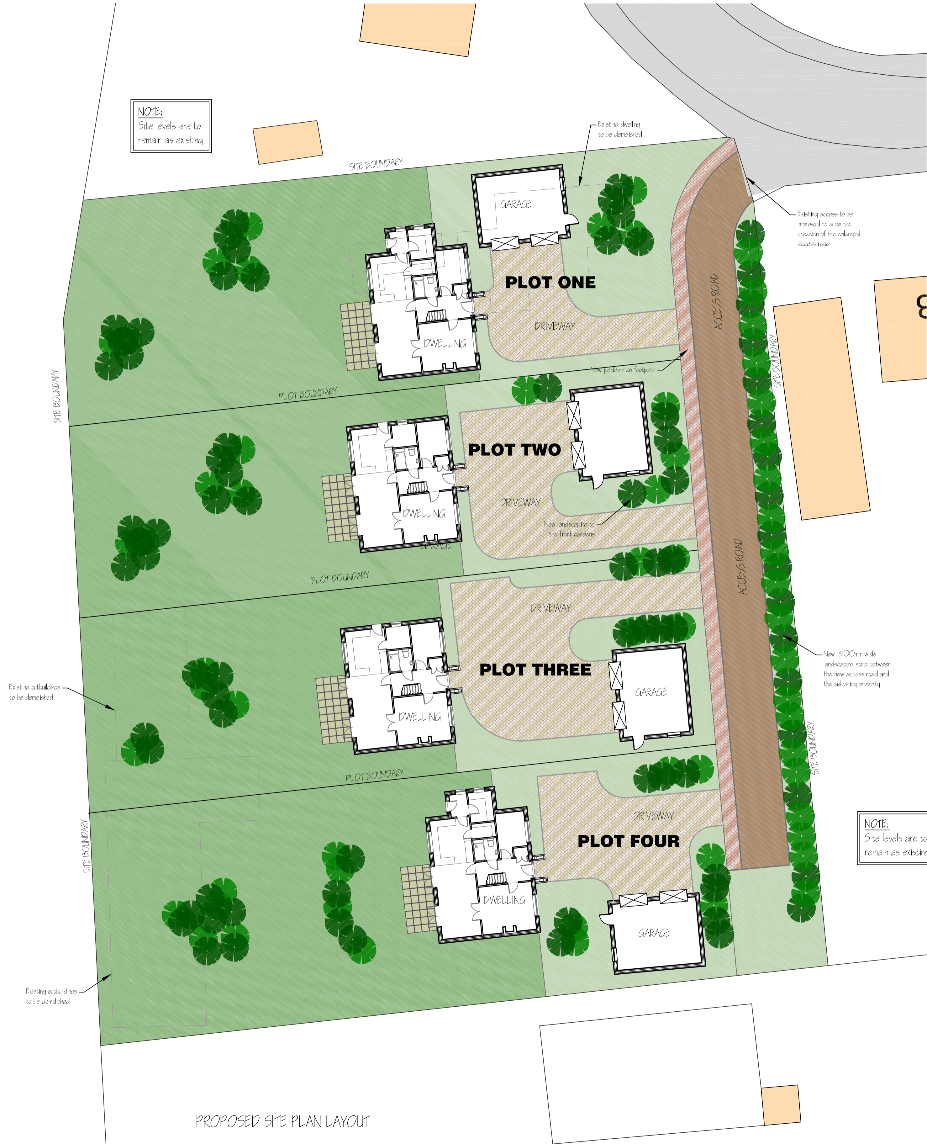
PROPOSED SITE PLAN LAYOUT