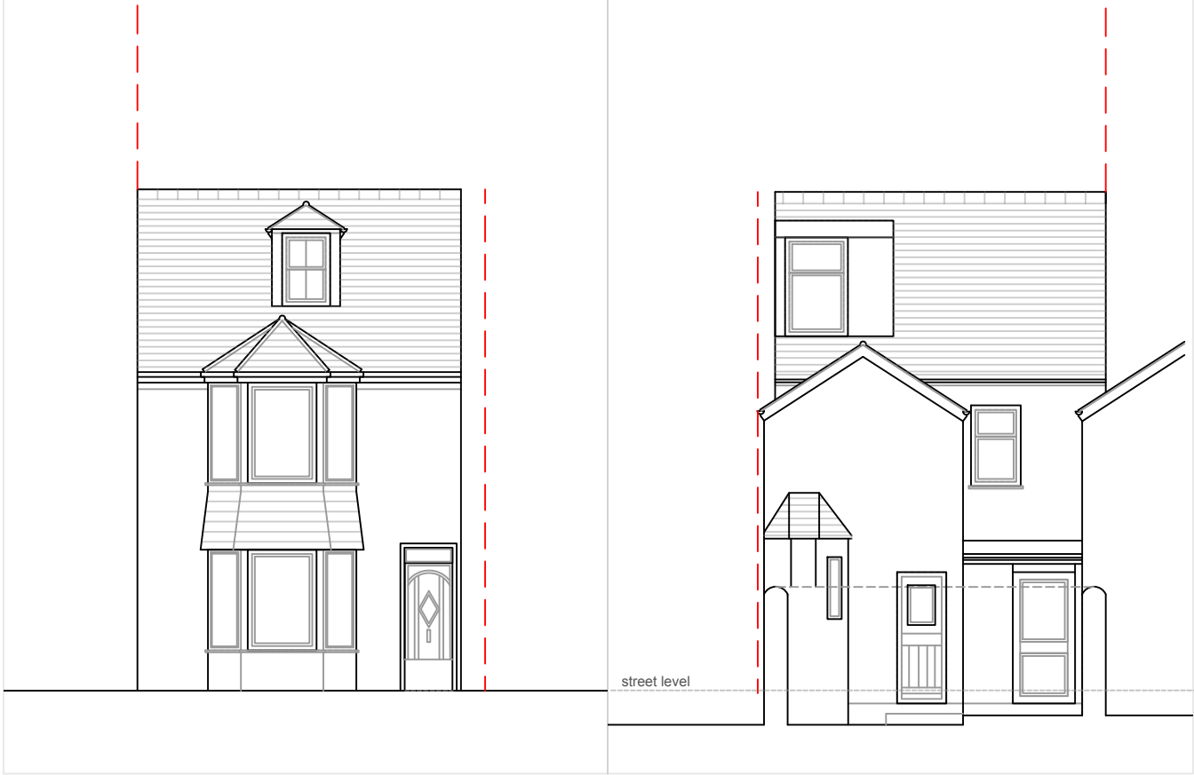
PROPOSED South East Elevation