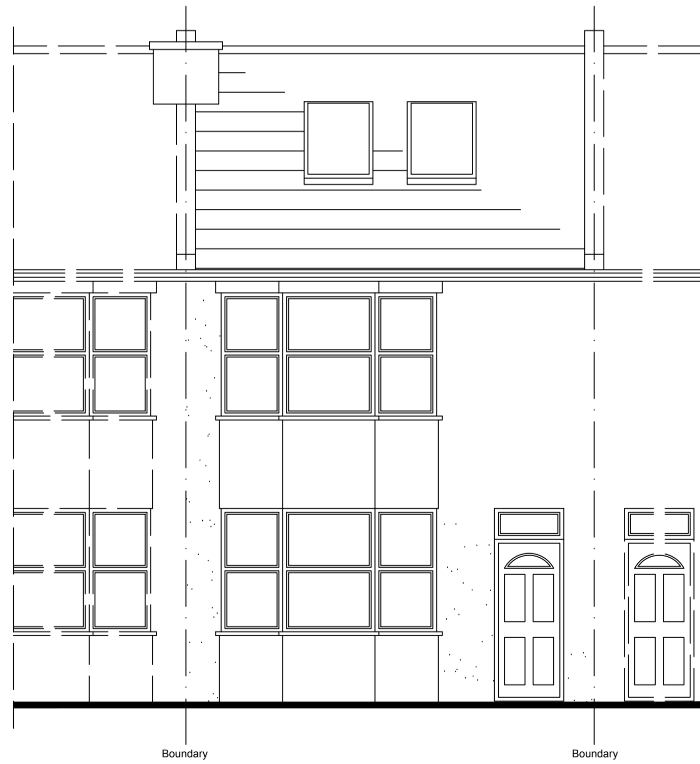
PROPOSED FRONT ELEVATION (scale 1:50)