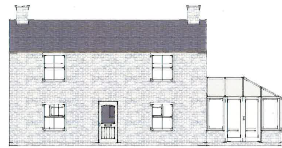
EXISTING WESTERN ELEVATION