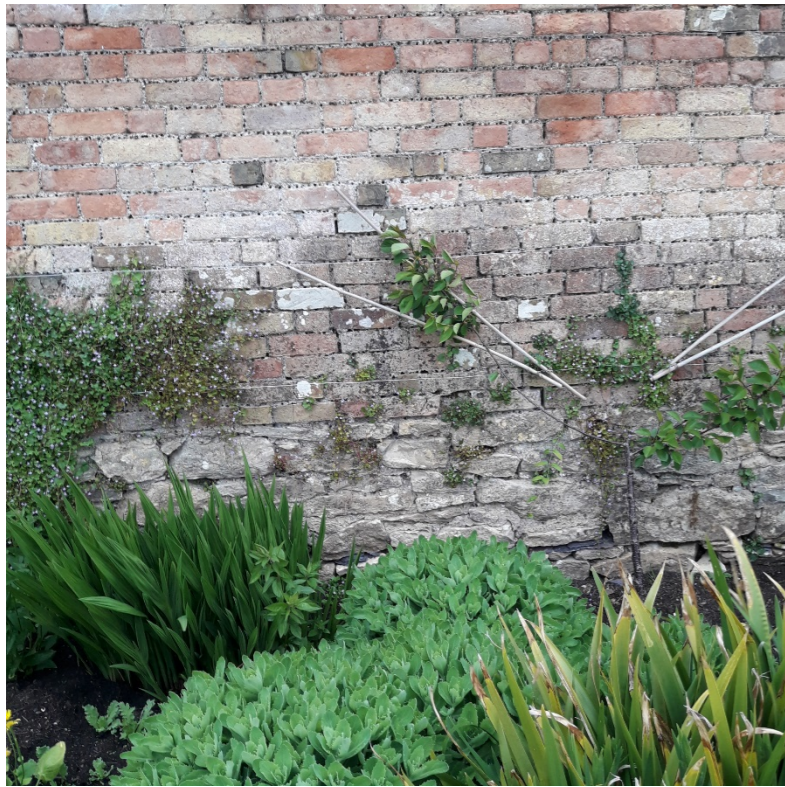
Section L built off rubble base