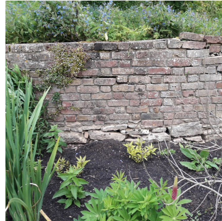
Section I: approx. 37m long and 1.1m to 1.2m high at front (not all shown)