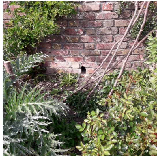
Weep hole in Section M