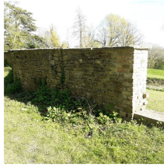
Rear of Section J