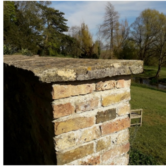
Section J Coping (West End)