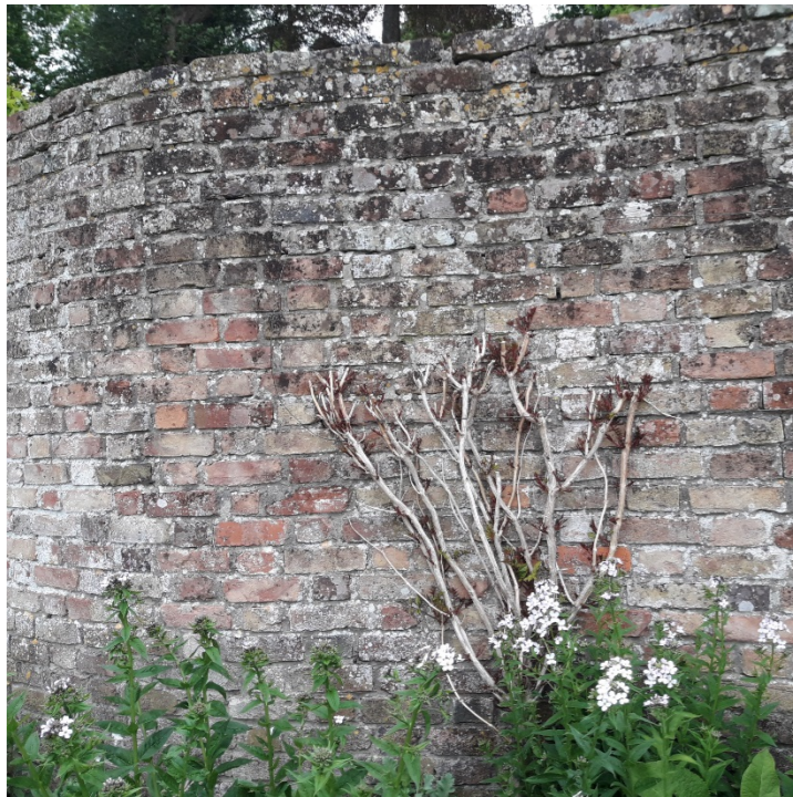
Section K 'crinkle-crankle' brickwork largely Flemish Bond