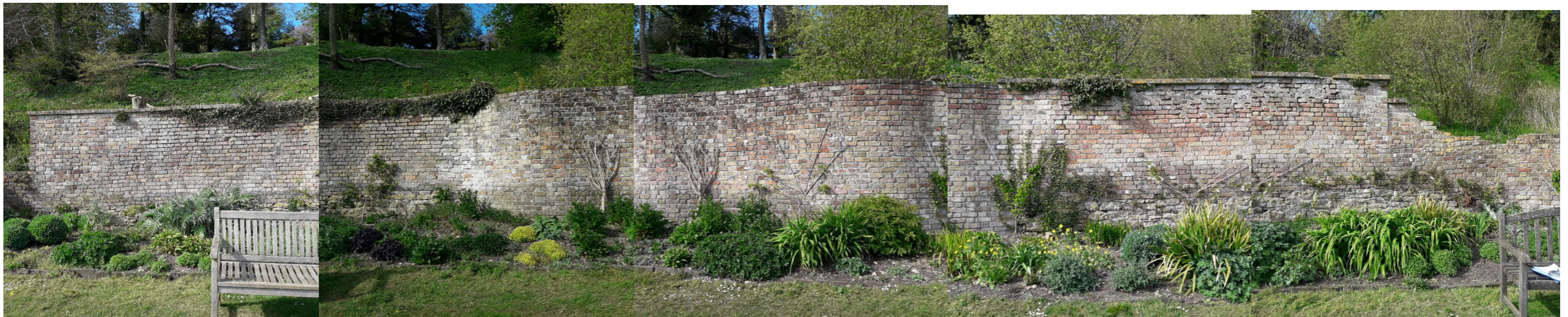
Section J: approx. 7m long and 2.5m high at front