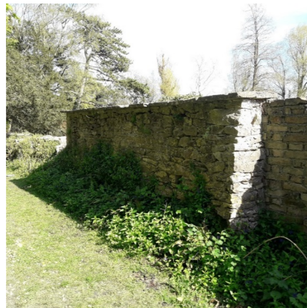
Rear Section L