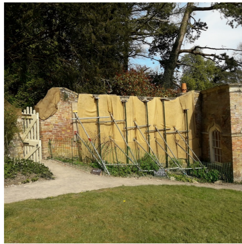
Section N Summerhouse Wall post collapse approx. 6.5m long, 2.7m to 3.8m high at front and 1.5m to 2.3m high at rear, 500mm thick