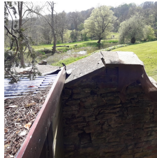
Junction between Shed and wall copings Section N