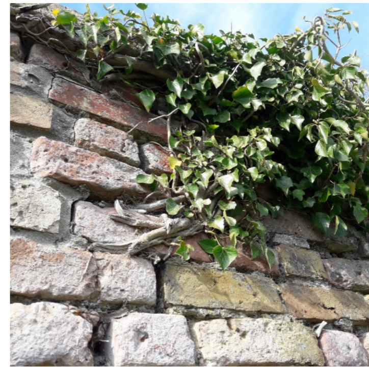
Vegetation growth within wall