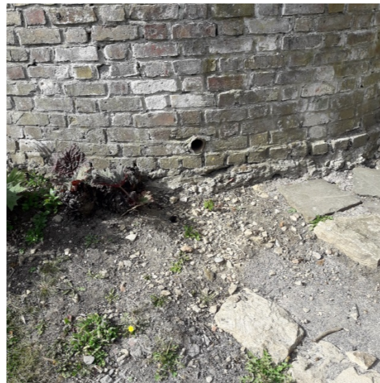
Modern weep hole in Section M