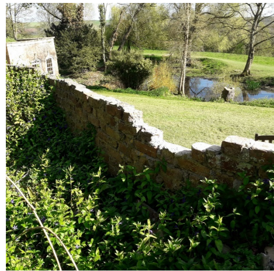
Rear of 'crinkle-crankle' wall Section M