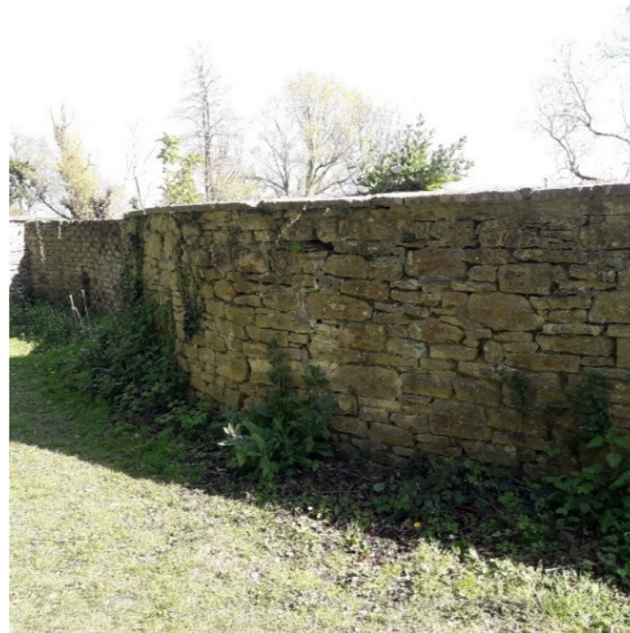
Rear rubble wall to Section K