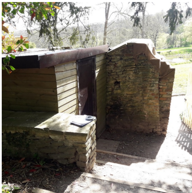
Modern shed behind Summerhouse Wall Section N