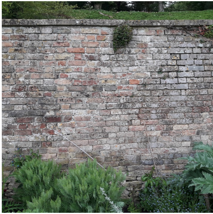
Section J Brickwork primarily Flemish Bond