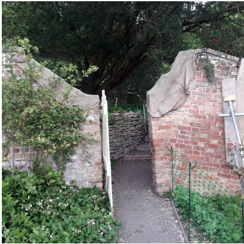
Section N 1970s Gateway in Summerhouse Wall