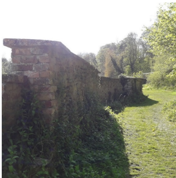
Rear of Section L