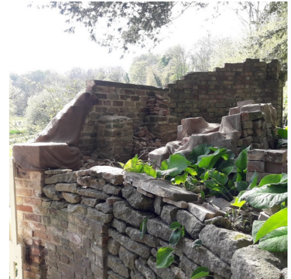
Rear of Section M by Archway