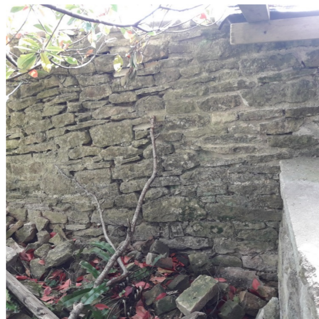
Rear face of Summerhouse Wall Section N