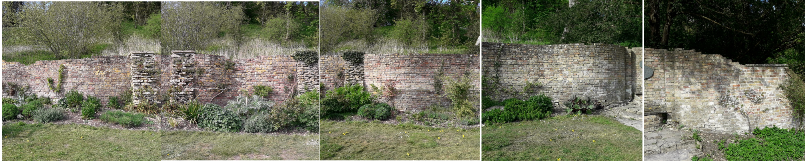
Section M (West to East) approx. 24m long and 2.1m high at front on average, 0.8m to 1.5m high at rear and 230mm thick