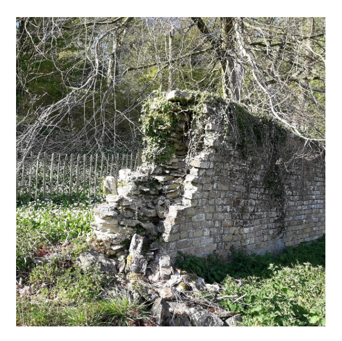
Collapsed wall at start of Section C