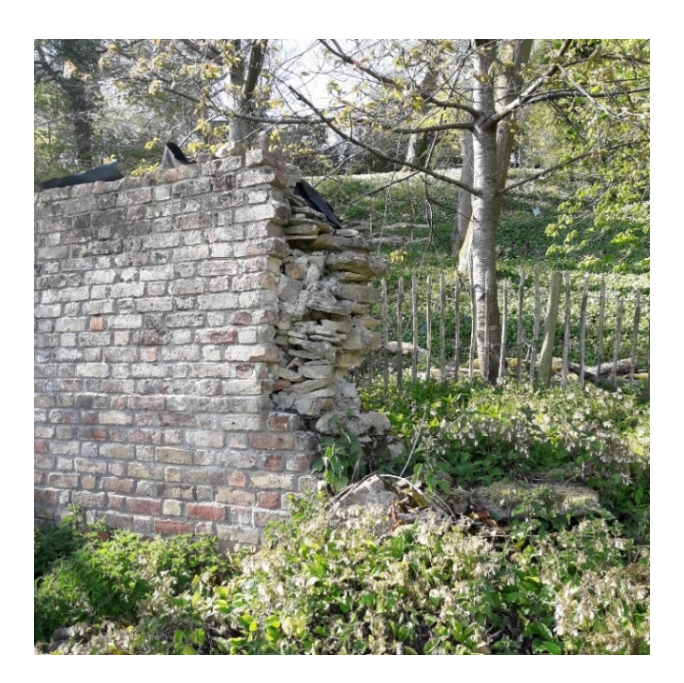
Collapsed wall at end of Section C