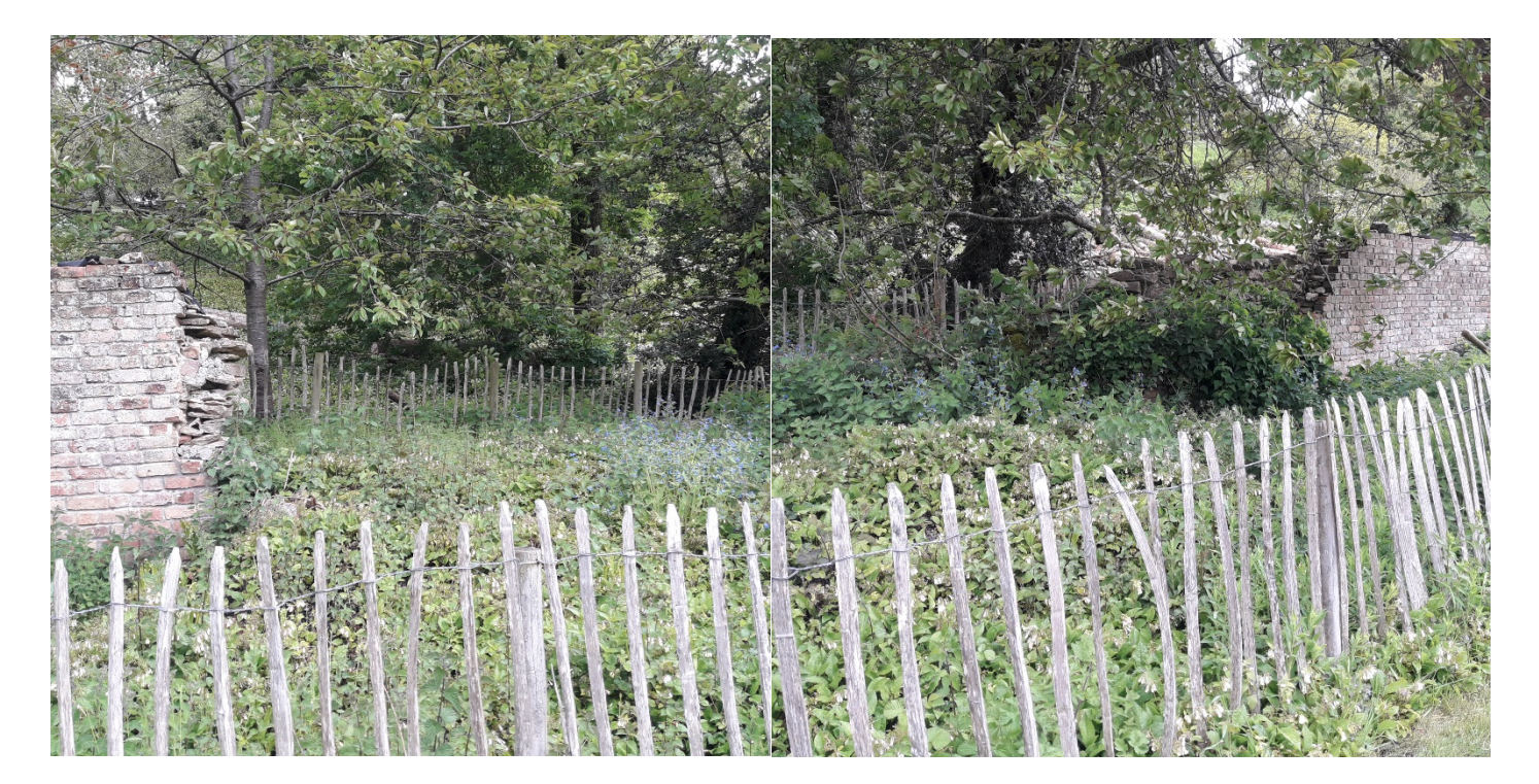
Section D – collapsed approx. 12.5m long