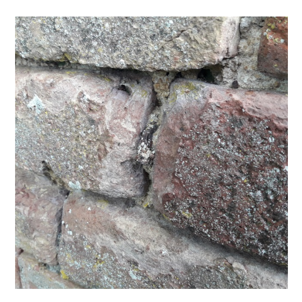
Old nail in Section C brickwork