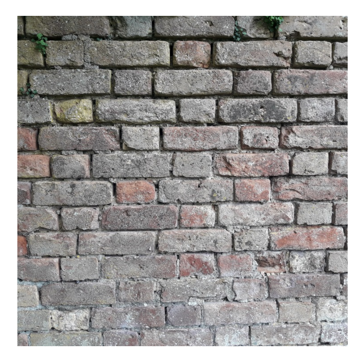
Brickwork to Section C Flemish Bond