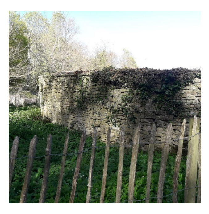
Section A Rear (West end)