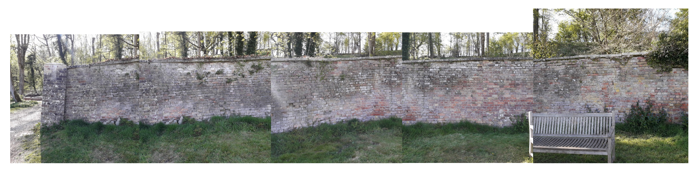
Section A (West to East): approx. 28m long and 2m to 2.5 high at front Section A: approx. 1.85m high at rear Section A: 520mm thick