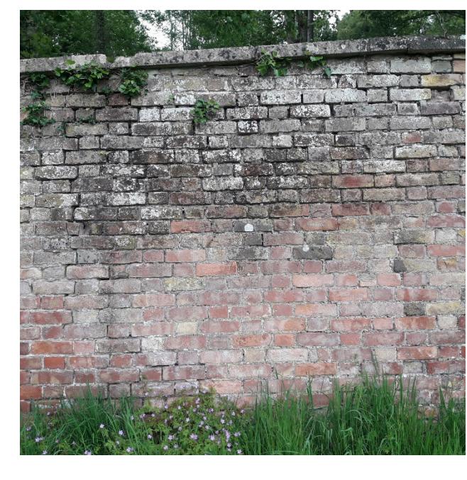
Section A Brickwork – Flemish Bond